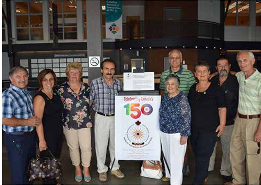
Members and guests of the Canadian Macedonian Historical Society unveil their plaque.

Contributions from vibrant cultural groups are what make Canada the strong and diverse country that it is today. This past year, we were honoured to add plaques to the Wadih M. Fares Wall of Tribute from the Brazilian Community of Toronto (Platinum Level) and the Canadian Macedonian Historical Society and the Academia do Bacalhau Social Club (Silver Level).