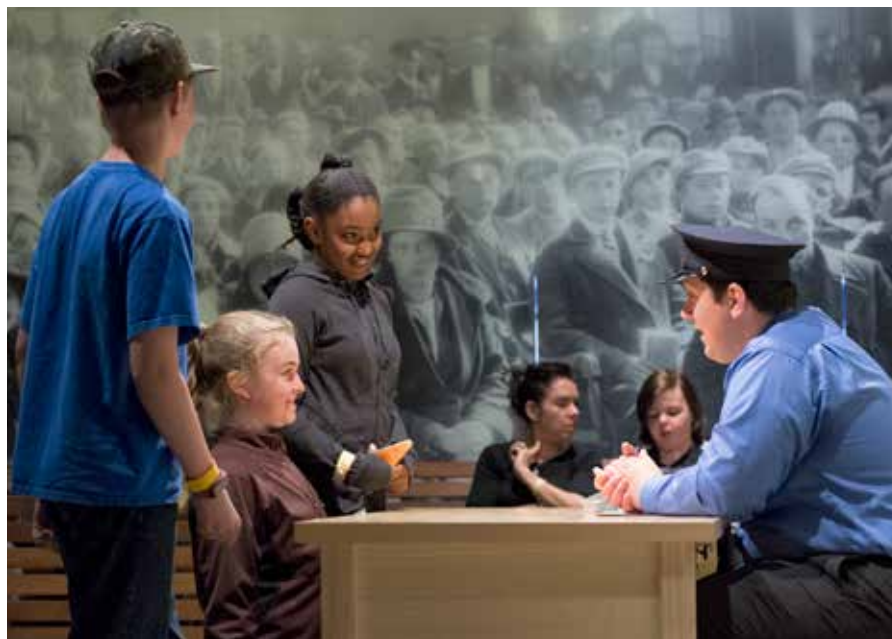
Students learn about Canada's immigration story from a Heritage Interpreter.