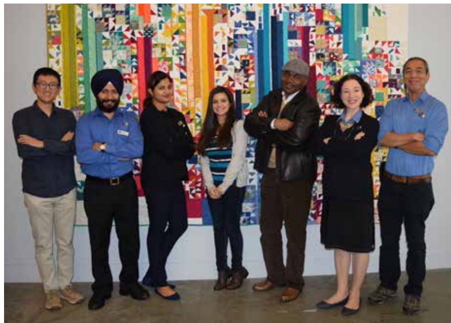
Our Welcome Home to Canada participants at their graduation ceremony.