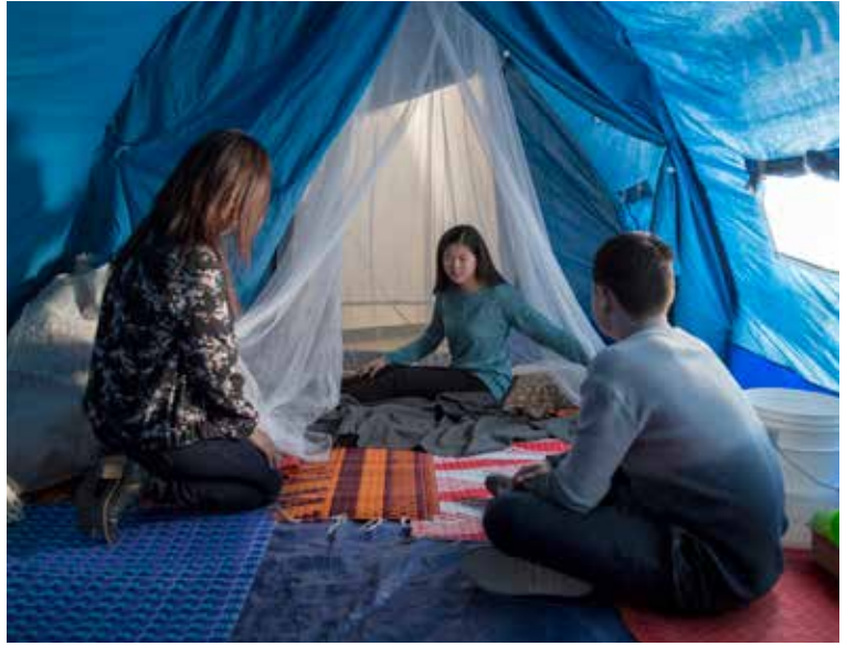
UNHCR refugee tent in Refuge Canada .