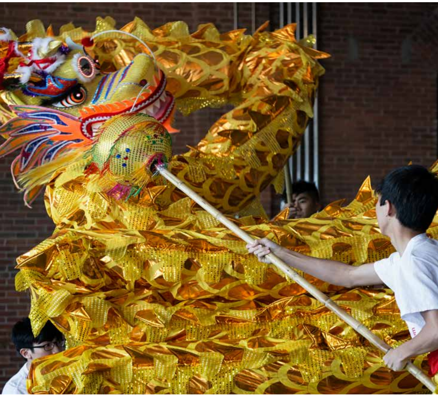
Top left: The Atlantic to Pacific Drumming Celebration on Canada Day at the Museum. Bottom left: The Walrus Talks at the Museum. Right: Dragon Dance at the Museum.