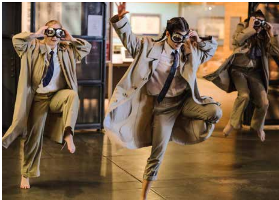
Members of Halifax Dance's Young Company perform Letters from the Front .