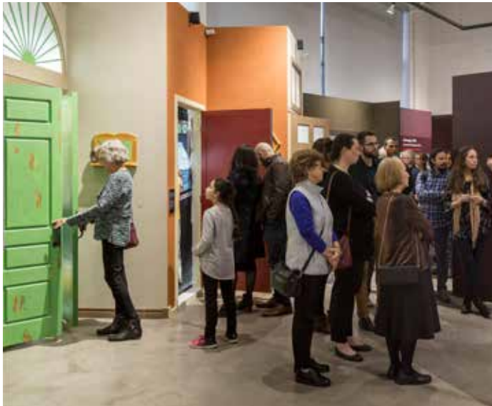
Official Opening attendees discover Refuge Canada .