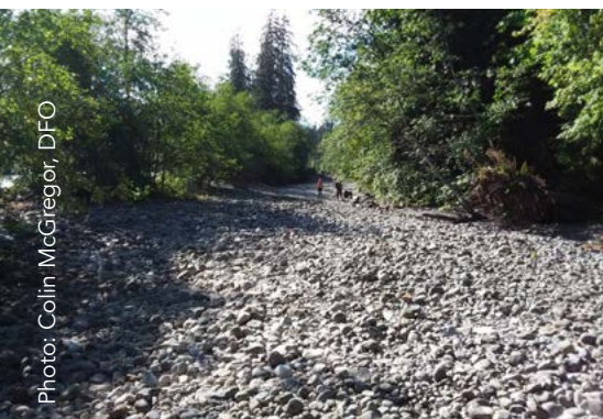
Gravel accumulation in the Second Island side channel prior to 2018 works

In the winter of 2014, a significant gravel accumulation at the mouth of the side channel limited, and at times prevented, water from entering. To temporarily re-establish surface water flow, the RRU removed approximately 3,500 cubic metres of gravel from the channel mouth during the summer of 2015, placing it outside of the side channel in the river main stem for spawning habitat.