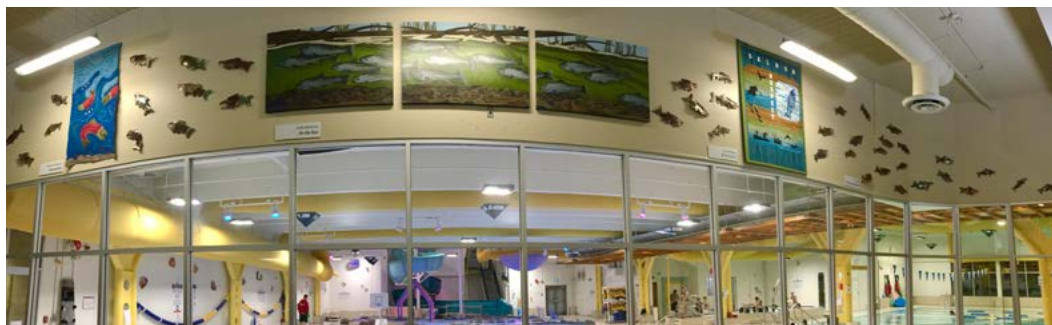
Salmonid and Habitat Health Through Art exhibit in the viewing area of the Sam Ketcham Pool