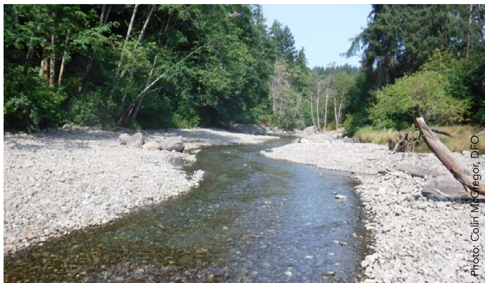
Second Island side channel following 2018 works