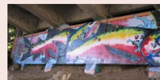
Salmon graffiti by Justin Kaczmarek

These are some salmon works of art in Nanaimo that you can check out (and others—search “salmon” in the inventory ) when attending the SEP Community Workshop.