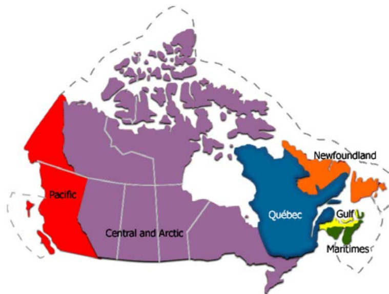
Figure 1. The administrative regions of Fisheries and Oceans Canada (DFO). The dashed line indicates Canada's Exclusive Economic Zone (EEZ).