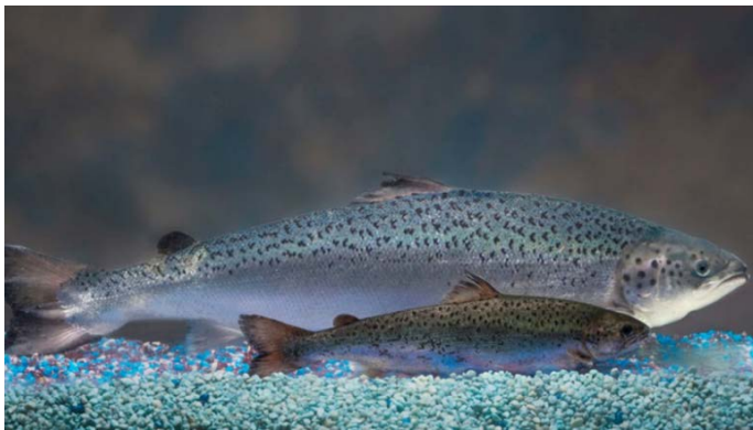
Figure 1. AquAdvantage® Atlantic Salmon (EO-1 \alpha Salmon) containing the opAFP-GHc2 transgenic construct (back) and non-transgenic Atlantic Salmon of equal age (front).