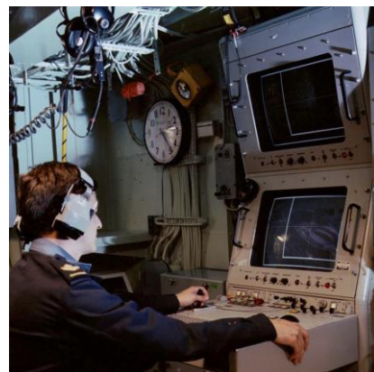
Figure 1: Operator's console for the AN/SQS-510 sonar system.

methods to process the received signals, especially the detection of weak target echoes. The availability of new transistor technology enabled systems that were able to filter out weak and random returns, and present an operator with a display of computer-generated contact information for the first time. The results of this Computer-Aided Detection and Tracking (CADAT) were implemented in the AN/SQS-510 sonar (Fig. 1) and adopted by the navies of Canada, Portugal, and Belgium. In anticipation of upgrades to the Aurora Long Range Patrol Aircraft and the Canadian Towed Array Sonar System (CANTASS), acoustic processing systems continued to be developed for naval air and surface combatants to facilitate the management of data from increasing large numbers of sensors and relate that data to the tactical situation.