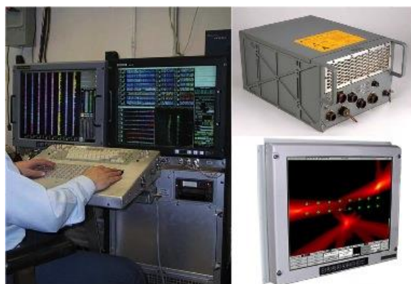
Figure 2: Left: IMPACT – airborne concept demonstrator; right: MVASP processor (top) and display (bottom).

The airborne processor was renamed IMPACT (Integrated Multistatic Passive / Active Concept Testbed) around 1995 to emphasize its capability for multistatic sonar (multiple acoustic sources and receivers). It was originally called XDAAP (eXperimental Development of an Airborne Acoustic Processor) in the 1980's and CASD (Concept Airborne Sonar Demonstrator) in the early 1990's. The IMPACT system was the first Canadian demonstration system designed for low frequency active sonar, and it was successfully demonstrated on several international Anti-Submarine Warfare (ASW) trials (Fig. 2). The work done on IMPACT played a significant role in the specifications for the CP-140 Aurora upgrade, MVASP, which was manufactured by General Dynamics Canada (GDC) with input from DRDC Atlantic.