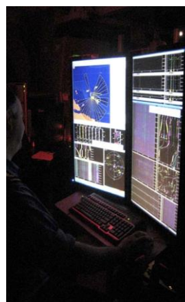
Figure 3: MAPS – shipboard concept demonstrator.

The current developmental shipboard system built using STB technology is called MAPS (Maritime Acoustic Processing System) (Fig. 3). MAPS is an integrated hull mounted sonar, sonobuoy and towed array sonar processing and display system that has been installed on the HALIFAX CLASS frigate as a Mission Fit since 2011. MAPS has served to inform the statement of requirements for the current Underwater Warfare Suite Upgrade and the upcoming Canadian Surface Combatant. In addition to MAPS, a variety of other STB applications have been developed over the years to satisfy the unique S&T objectives of individual sonar related projects. These S&T applications have enable real-time processing and display during experimental trials, where new algorithms and displays are continually conceived, tested and refined.