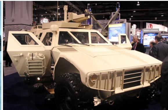
(d) General Tactical Vehicles AGMV