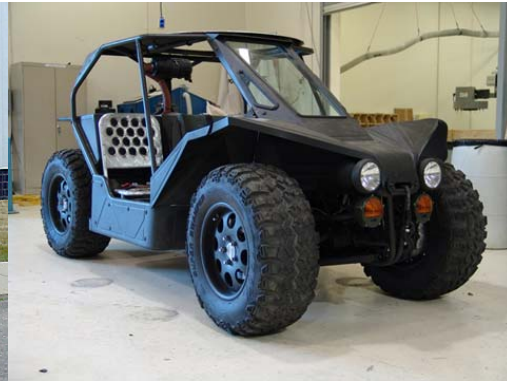
(b) Raytheon Hy-DRA