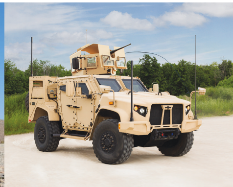
(f) Oshkosh L-ATV