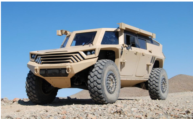
(e) Millenworks L-UTV