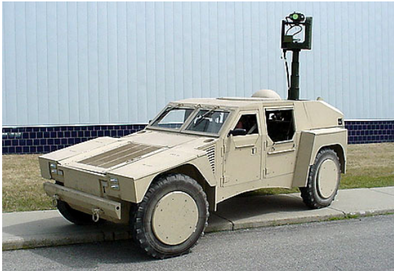
(a) GDLS RST-V