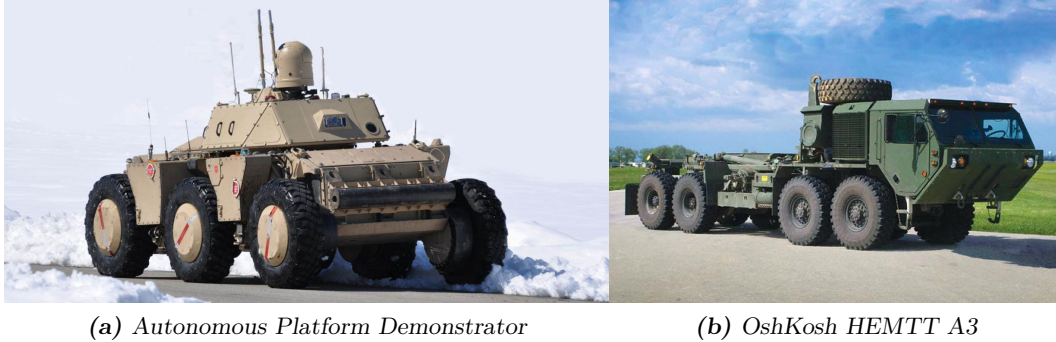
Figure 5: Series Diesel-Electric Hybrid Prototypes.

HEMTT A3 prototype (Figure 5b) the company claims a 20% gain in fuel efficiency, a 40% roomier cab, improved crew safety, increased on-board electrical generation capacity, and a 3000lb weight reduction [45].