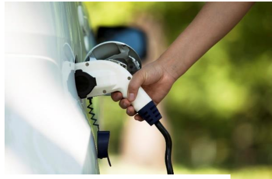
Electric vehicle charging

The Department is supporting progress towards a low carbon transportation sector through the delivery of programs for both passenger vehicles and the freight sector. NRCan is advancing the development of a national Zero Emission Vehicle Strategy xxi for Canada to deploy more low-emission vehicles on Canada’s roads, while also supporting the government-wide Clean Fuel Standard Initiative xxii to incent the use of a