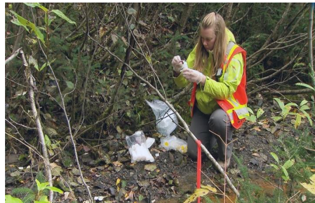
The photo reflects water sample collection and analysis at a mining site

The Department will also continue to make its science more accessible, open and transparent for Canadians. In support of Canada’s commitments under the 4th National Action Plan on Open Government , NRCan will develop an Open Science Roadmap to provide a plan for greater openness in its science and research activities. Cognizant that Canadians rely on NRCan science to inform decision-making in government, industry and public fora, the Department will increase engagement with Canadians to support enhanced dialogue and interaction between knowledge generators and knowledge users.