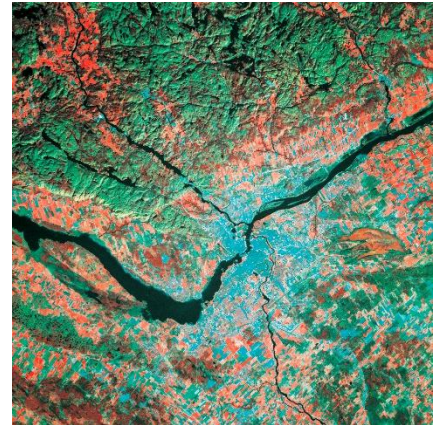
Geospatial image of the city of Ottawa, Ontario

that informs the science and mapping work for the Department, other federal departments and the provinces and territories. NRCan also uses a variety of assets such as satellite ground stations to collect valuable data on the status and trends of our changing lands, water and infrastructure. With the launch of the new federal RadarSat Constellation Mission satellite, the Department will receive data for more rapid and complete coverage of Canada’s landmass and off-shore territories to use for science-based decision making. Other federal departments will be able to utilize the same data for agriculture related use, census surveys and arctic and off-shore surveillance and monitoring.