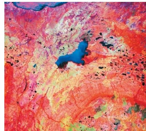
Geospatial image of Great Slave Lake, Northwest Territories

As part of ensuring transparency and sharing information on resource development projects, including on their cumulative effects, NRCan will co-lead, with Environment and Climate Change Canada xxxvii the development of an online Open Science and Data