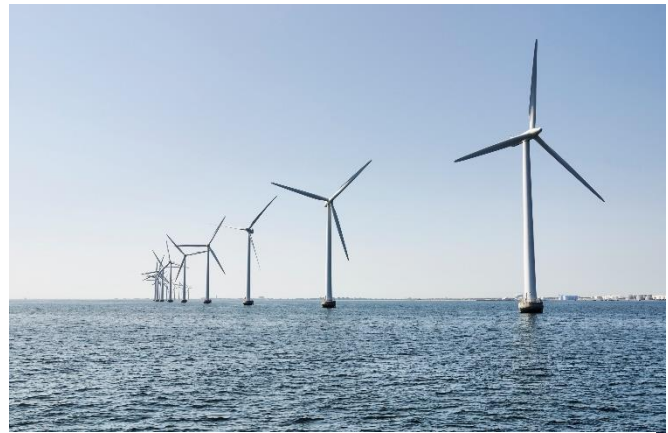
Wind turbines producing clean energy

Infrastructure Program , xv funding research, development, demonstration and deployment projects in areas such as, smart grids , xvi energy efficiency, energy efficient buildings , xvii emerging renewable power , xviii alternative fuel infrastructure xix and clean energy for rural and remote communities . xx NRCan is also supporting the government-wide priority of putting more low-emission vehicles , including electric vehicles (EV) , on the roads in Canada through programming for both passenger vehicles and the freight sector and through contributing to the National Zero Emission Vehicle (ZEV) Strategy xxi and Clean Fuel Standard Initiative . xxii