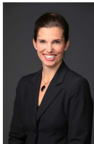
The Honourable Kirsty Duncan Minister of Science and Sport

Together with Canadians of all backgrounds, regions and generations, we are proud to be building a strong, equitable, diverse and inclusive science culture that will position Canada as a global leader in natural sciences and engineering research and innovation.