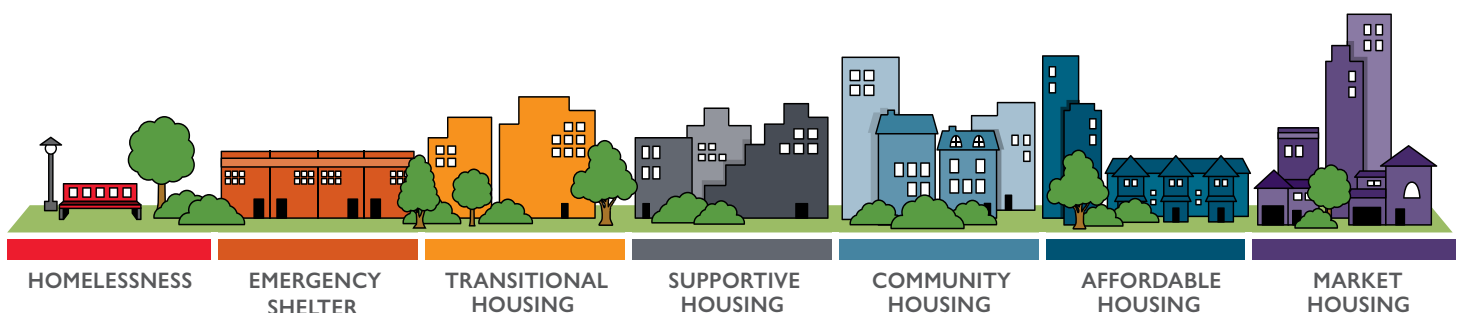
Figure 2: The housing continuum