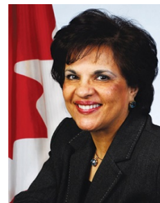
* The Honourable Mobina S.B. Jaffer Deputy Chair