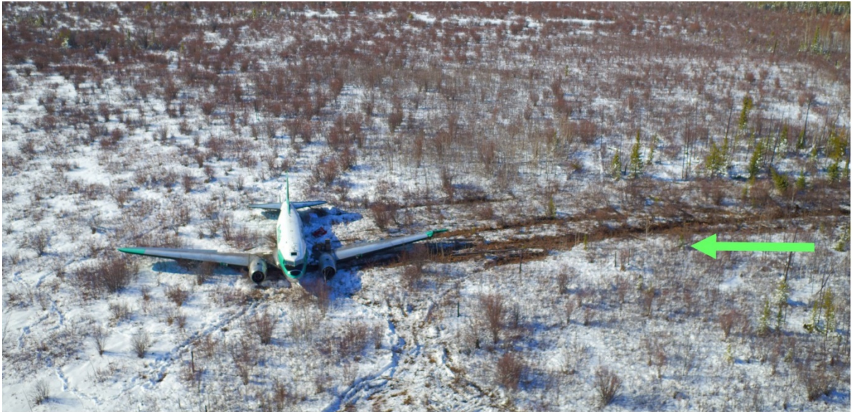
Figure 2. Aerial photo of the accident site looking northwest. The green arrow indicates the aircraft's path on touchdown.

locating the aircraft. The flight crew was uninjured. The aircraft received substantial damage (Figure 2). There was no post-impact fire. First responders arrived at the accident site at 1114.