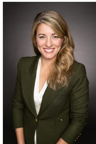
The Honourable Mélanie Joly Minister of Economic Development and Official Languages

Together, we will deliver on our commitment to fostering a dynamic and growing economy that creates jobs, attracts global investment, respects environmental goals and presents opportunities for a good quality of life for all Canadians.