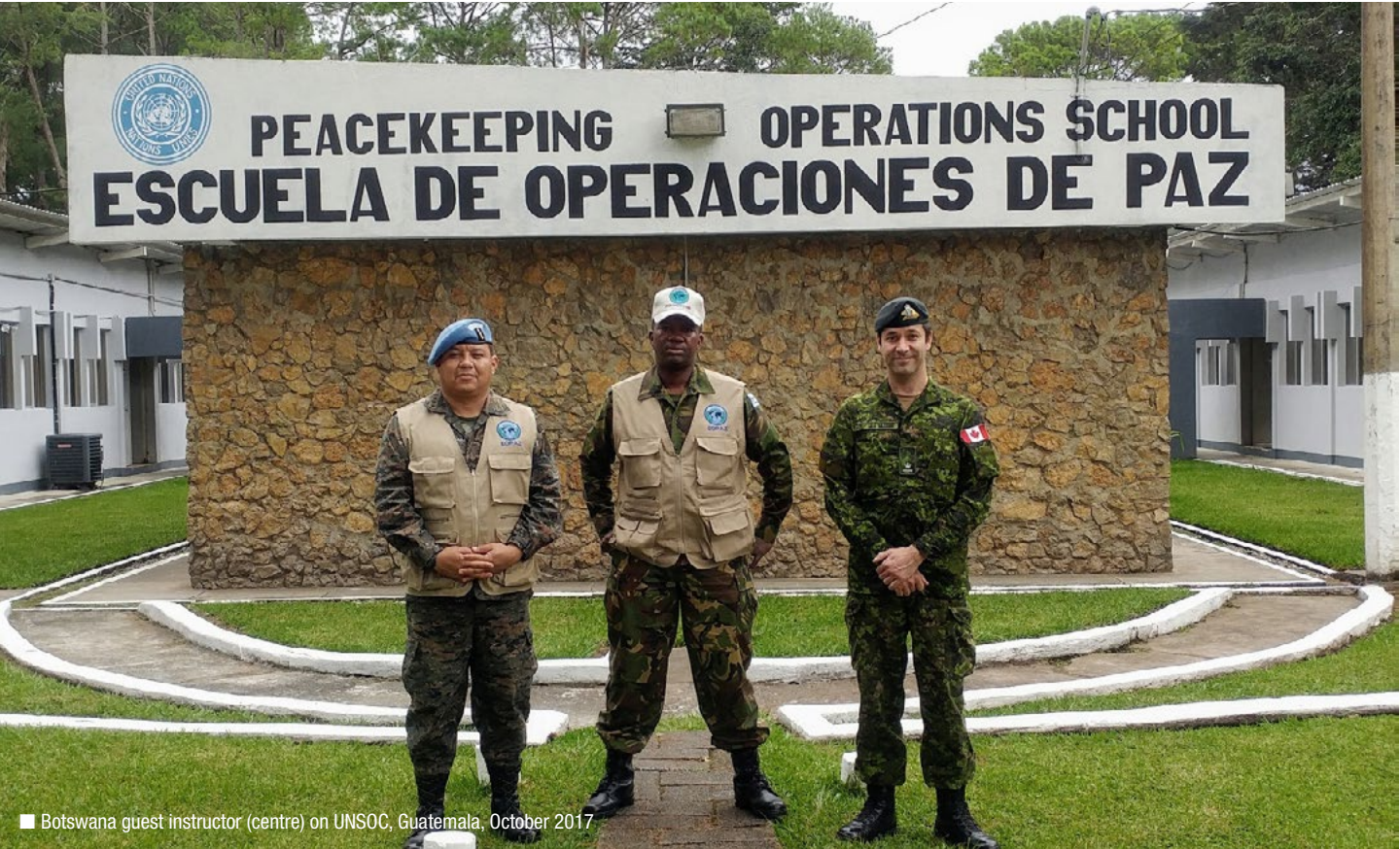
■ Botswana guest instructor (centre) on UNSOC, Guatemala, October 2017

101 Colonel By Drive Ottawa, Ontario, K1A 0K2