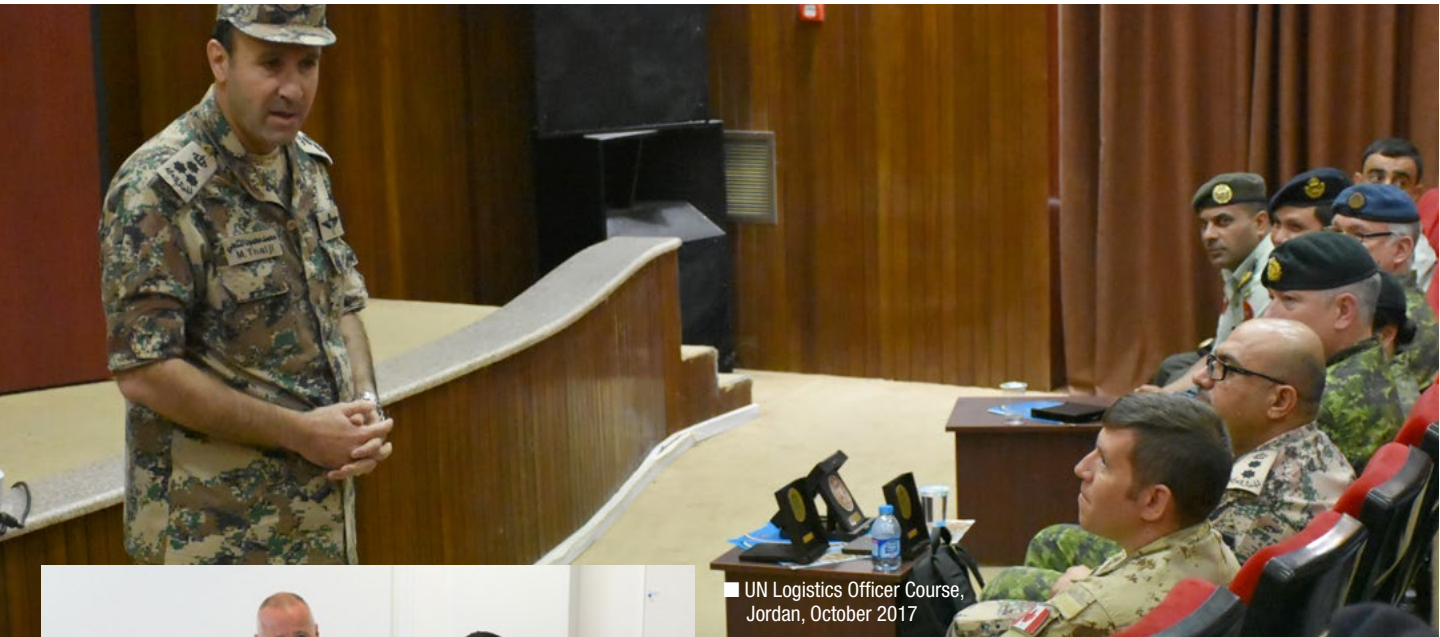
■ UN Logistics Officer Course, Jordan, October 2017