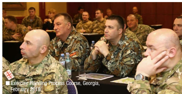
■ Exercise Planning Process Course, Georgia, February 2018

The MTCP leads and funds specific international exercises. It also offers Exercise Planning Process Courses (EPPC) to select member states. EPPC aims to prepare personnel to perform the duties of an Exercise Planner, including exercise design, development, delivery facilitation, confirmation techniques, and follow-up procedures. In 2017-18, EPPCs were held in Ukraine, Georgia, Montenegro and Colombia. MTCP also supported Ex Maple Arch, a multi-national command post exercise, in Poland.