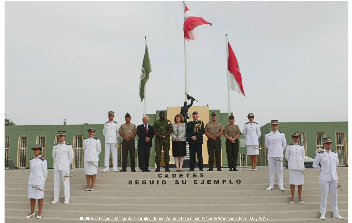
■ VIPS at Escuela Militar de Chorrillos during Women Peace and Security Workshop, Peru, May 2017