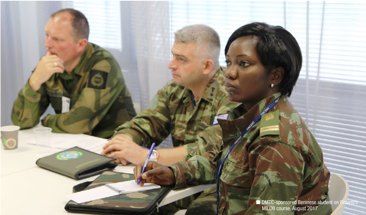
■ DMTC-sponsored Beninese student on Finland's MILOB course, August 2017