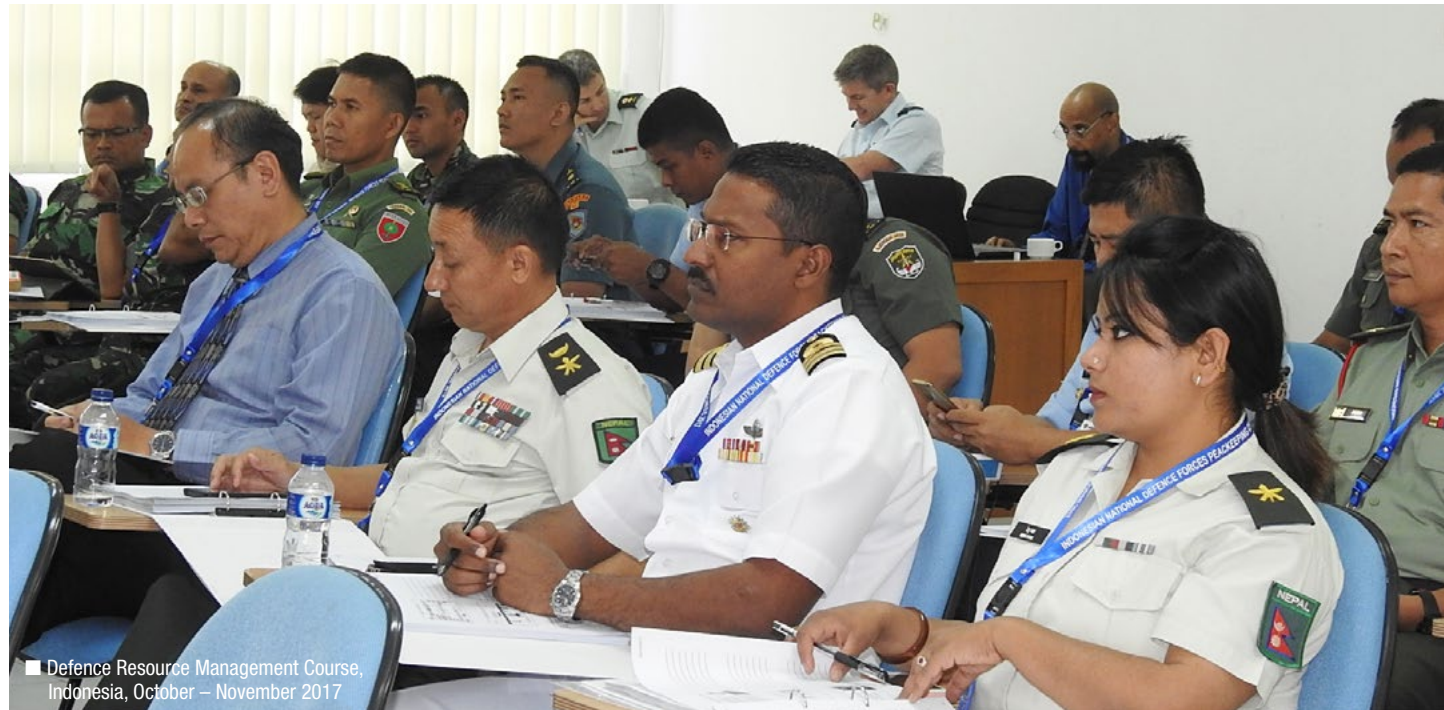
■ Defence Resource Management Course, Indonesia, October – November 2017