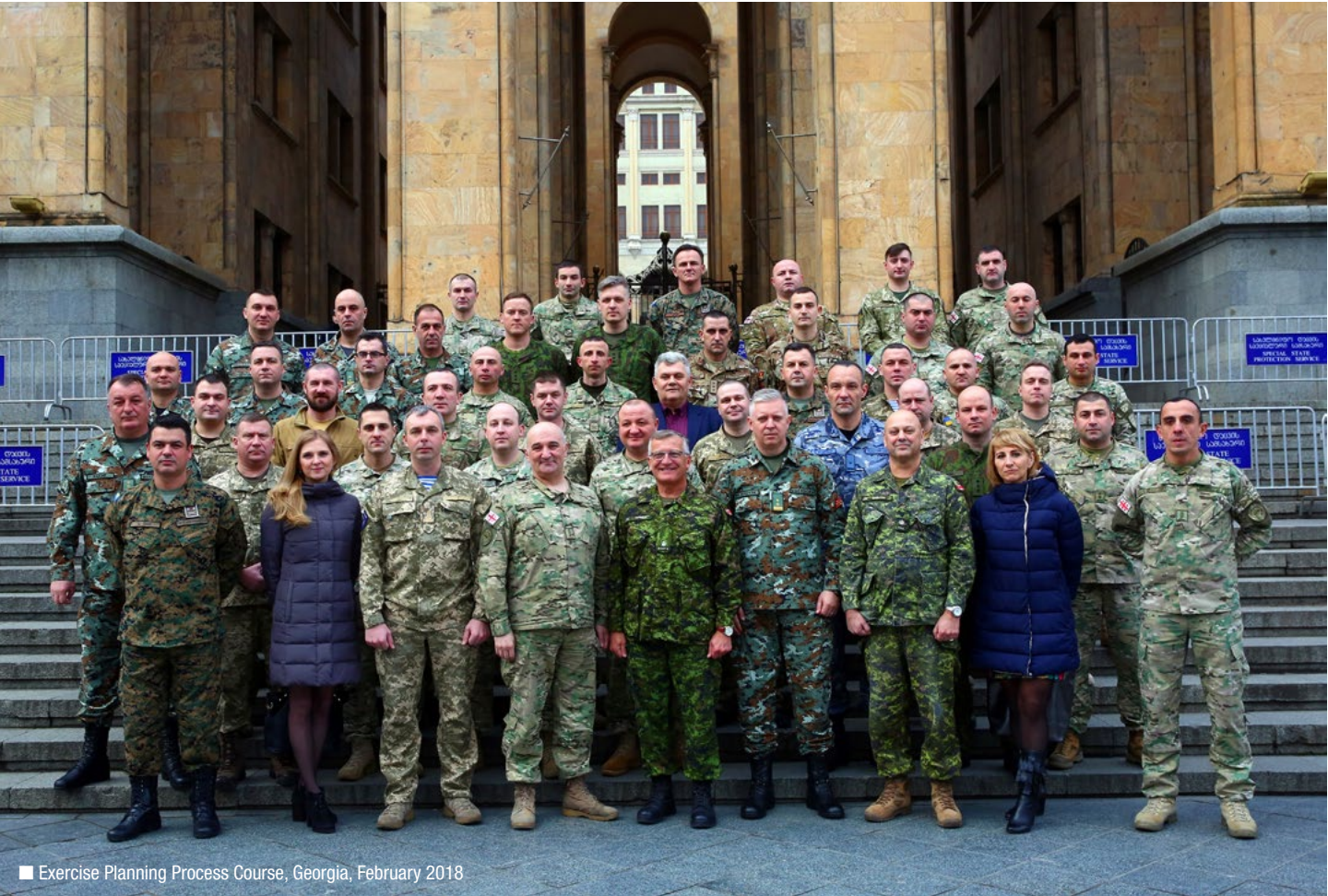
■ Exercise Planning Process Course, Georgia, February 2018

Finally, the Program responds to DND/CAF's Guidance on International Priorities for Defence Engagements, which provides guidance on international defence diplomacy activities and promotes prioritization and coherence in resource allocation. The Strategy outlines the fundamental interests driving defence diplomacy and provides a framework for prioritization.