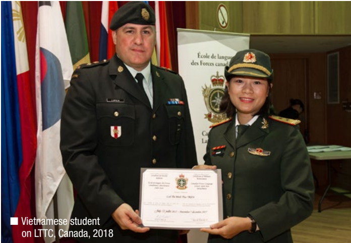
Canada is often seen as a model for countries looking to develop and institutionalize language training programs or establish a second official language, as is the case with The Georgian Armed Forces.

In addition to courses, MTCP often sponsors expert visits related to language training. In October 2017, DMTC funded a visit to Georgia by the Canadian Defence Academy's Chief of Standards for Foreign Languages. She was able to discuss DMTC assistance for the country's language training program. Having institutionalized two official languages,