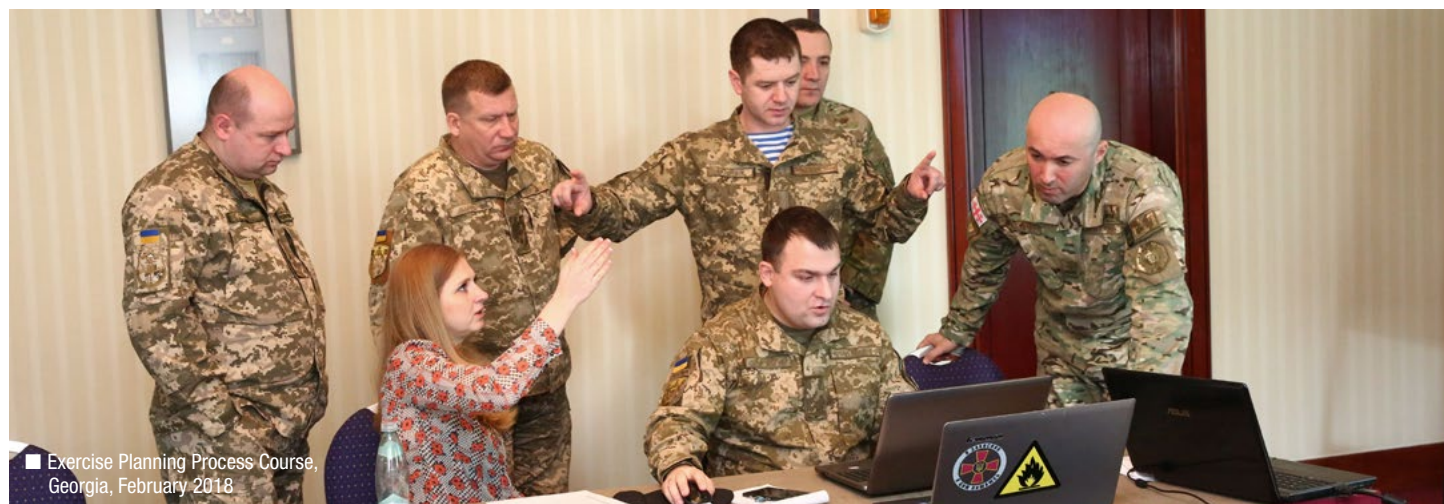
■ Exercise Planning Process Course, Georgia, February 2018