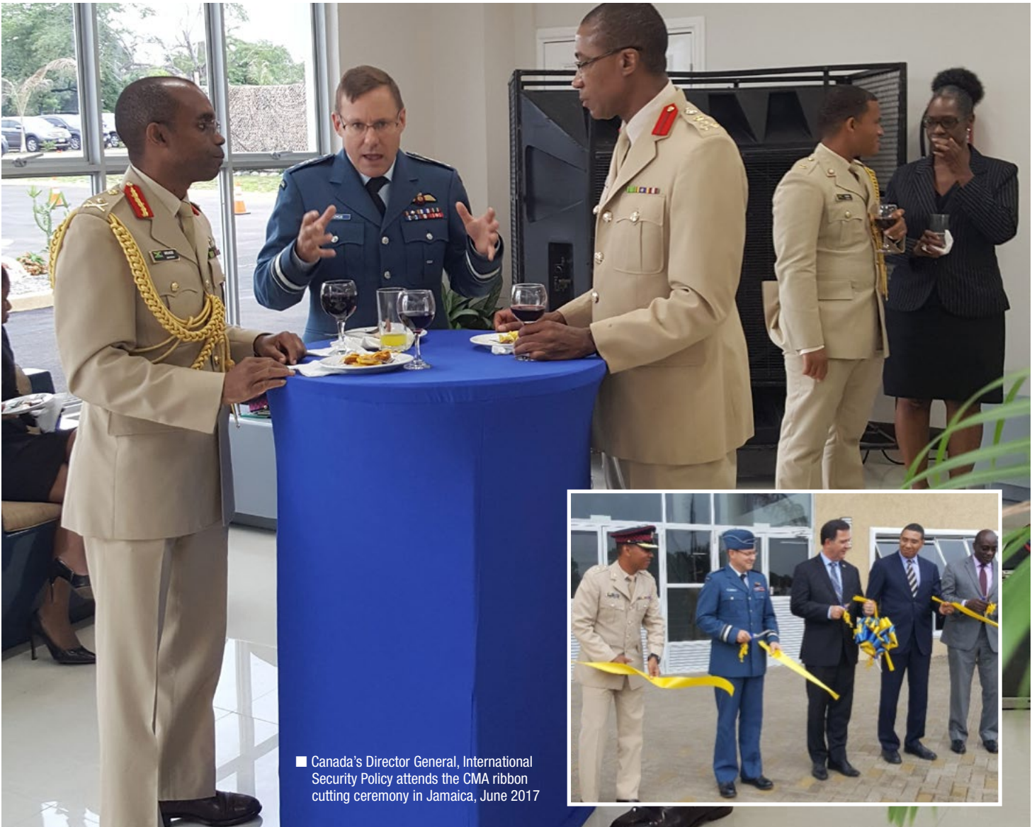
Canada's Director General, International Security Policy attends the CMA ribbon cutting ceremony in Jamaica, June 2017

The last COE to be supported was the Caribbean Military Academy (CMA - formerly the Directorate of Training and Doctrine). The CMA was completed in April 2017. The Academy includes classroom and conference capabilities, and delivers command, oversight, and administrative and training support for the other COEs, as well as the MTCP-sponsored Caribbean IT Program and Training Development Officer Courses. It is meant to enhance the participation of foreign students and instructors from South America, Africa, and Asia. A ribbon cutting ceremony occurred in June 2017 and was attended by DND's Director General, International Security Policy and Canada's High Commissioner to Jamaica.