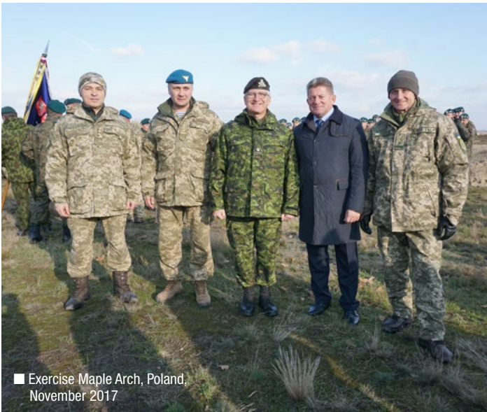
■ Exercise Maple Arch, Poland, November 2017

The MTCP’s mandate has evolved over the years to reflect the changing times and accommodate a broader range of emerging countries. Today, the Program aims to: ● Enhance peace support interoperability among Canada’s partners ● Expand and reinforce Canada’s bilateral defence relations ● Promote Canadian democratic principles, the rule of law and the protection of human rights in the international arena ● Achieve influence in areas of strategic interest to Canada