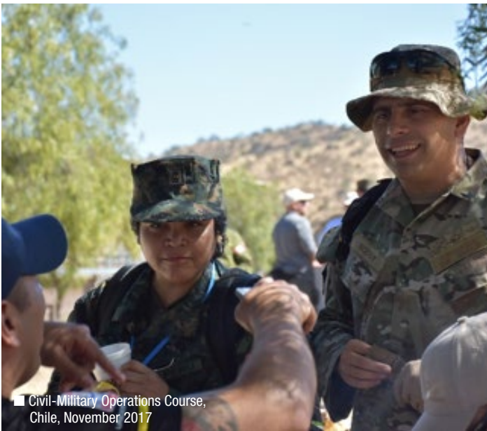
■ Civil-Military Operations Course, Chile, November 2017