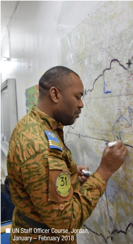
■ UN Staff Officer Course, Jordan, January – February 2018

Canada’s Military Training and Cooperation Program (MTCP) emerged from a series of international agreements made during the early 1960s, initially aimed at providing military advisors and training assistance to select, newly-independent Commonwealth countries. In the years that followed, the Directorate of Military Training and Cooperation (DMTC) was established under the Department of National Defence and the Canadian Armed Forces’ (DND/CAF) Directorate General of International Security Policy (DGIS Pol) to develop the policy governing the MTCP and direct its implementation. Today, the MTCP includes 67 developing, non-NATO countries in Africa, Asia, the Middle East, the Americas, and Europe, and is a key instrument of Canadian foreign and defence diplomacy, often constituting the first point of entry to strategically-relevant countries. It leverages DND/CAF and international institutions to deliver military training and capacity building projects to its membership, with a focus on activities that enable joint participation in peace support operations.