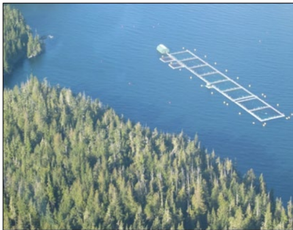
Net-pen along the coast of British Columbia.