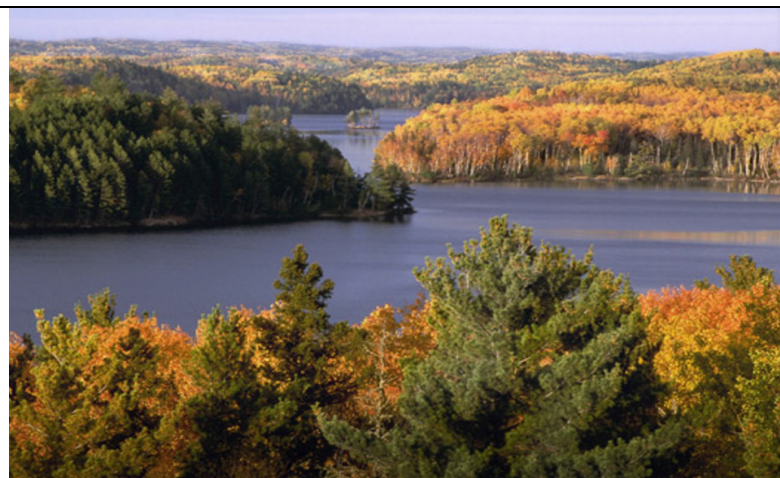
Mixed forest with sugar maple ( Acer saccharum ), yellow birch ( Betula alleghaniensis ) and eastern white pine ( Pinus strobus ) on Precambrian Shield terrain. Muskoka region, Ontario.

Three subtypes distinguish regional variation within this Macrogroup. Subtype CM014a [Subhumid Eastern Temperate Hardwood – Conifer Forest] describes temperate forests west of Lake Superior that occur in a generally drier climate with little or no presence of sugar maple, yellow birch or eastern hemlock. CM014b [Humid Eastern Temperate Hardwood – Conifer Forest] describes maple – yellow birch – balsam fir dominated forests east of the Great Lakes that contain significant presence of eastern white pine, red pine and northern red oak. CM014c [Very Humid Eastern Temperate Hardwood – Conifer Forest] describes maple – yellow birch – balsam fir dominated forests in the maritime-influenced climate of the eastern portion of the range, containing greater abundance of balsam fir and significant red spruce content.