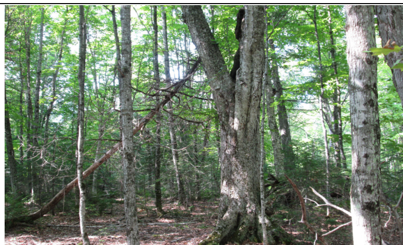
Sugar maple ( Acer saccharum ) stand with yellow birch ( Betula alleghaniensis ), eastern white cedar ( Thuja occidentalis ) and balsam fir ( Abies balsamea ). The understory is dominated by evergreen wood fern ( Dryopteris intermedia ) and regenerating balsam fir. North of Sault Ste. Marie, Ontario.