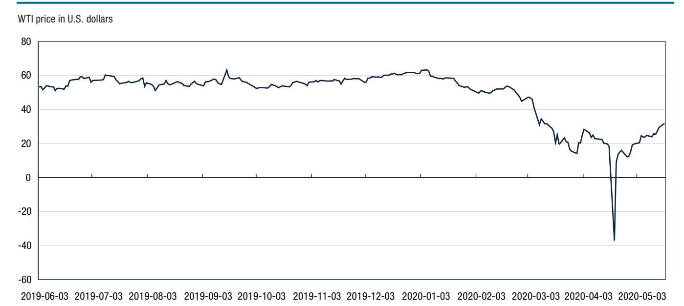
Chart 1 Daily West Texas Intermediate price, June 2019 to May 2020

Note: WTI = U.S. West Texas Intermediate