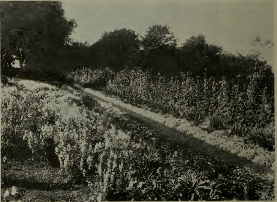
Annuals at the Central Farm, Ottawa: showing borders of sweet alyssum and candytuft.

1 Poisoned bran mixture to control cutworms—Mix thoroughly \frac{1}{2} lb. Paris green with 20 lb. bran while both are dry. Dissolve 1 quart of molasses in 2 gallons or more of water, then pour this into the poisoned bran and stir until all the bran is moistened thoroughly. In smaller quantities use 1 quart of bran, 1 teaspoonful of Paris green, and one tablespoonful of molasses with enough water to moisten the poisoned bran. Spread on the surface of the ground near the plants as soon as they are set out. The cutworms come out at night, eat the poisoned bran and are killed.