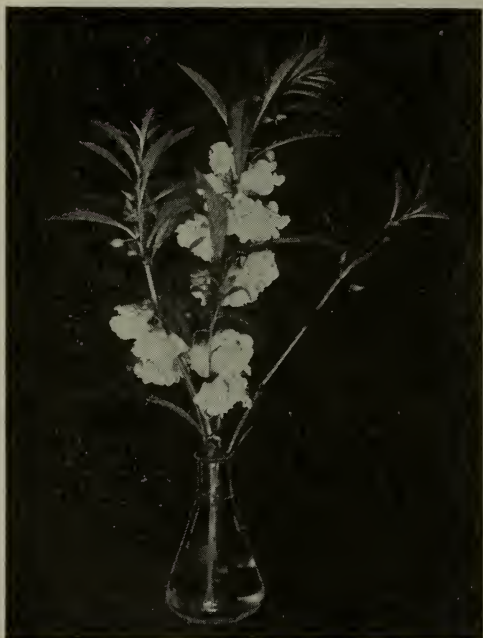
Balsam—Camellia-flowered. (See under Impatiens ).