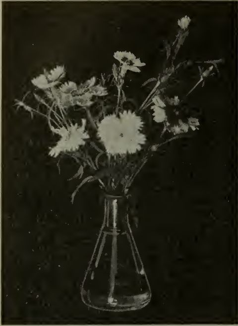
Dianthus heddwigi —Single-flowering.