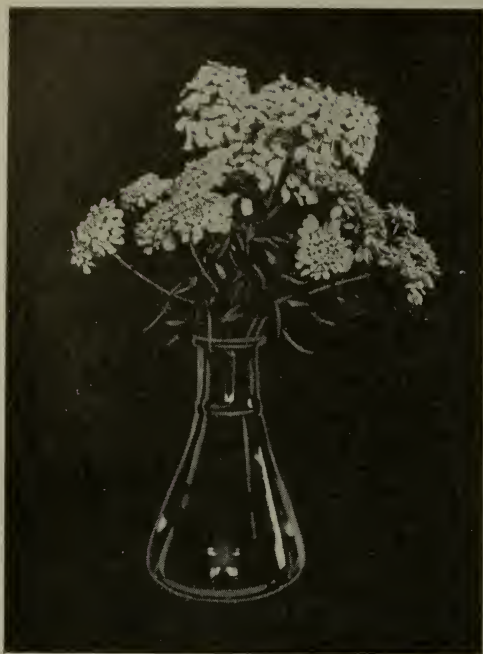
Candytuft. (See under Iberis ).