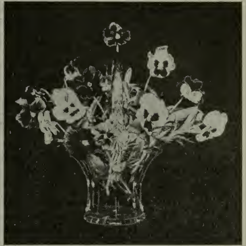
Pansies. (See description under Viola ).