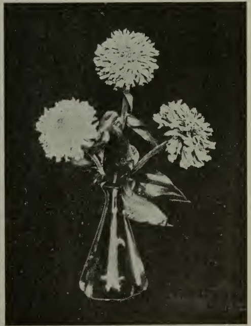
Zinnia—"Curled and crested".