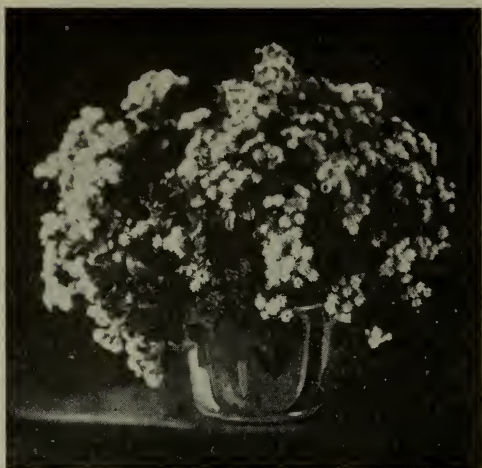
Ageratum —"Blue Star".