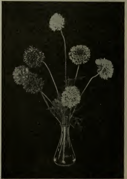
Double-flowering gaillardia .