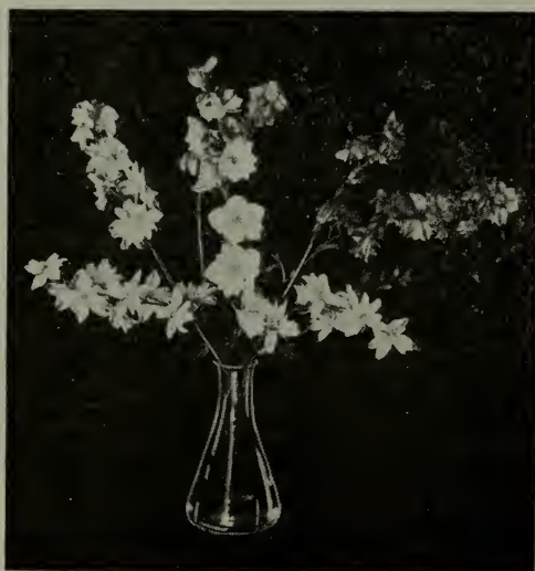
Larkspur—Stock-flowered. (See under Delphinium ).