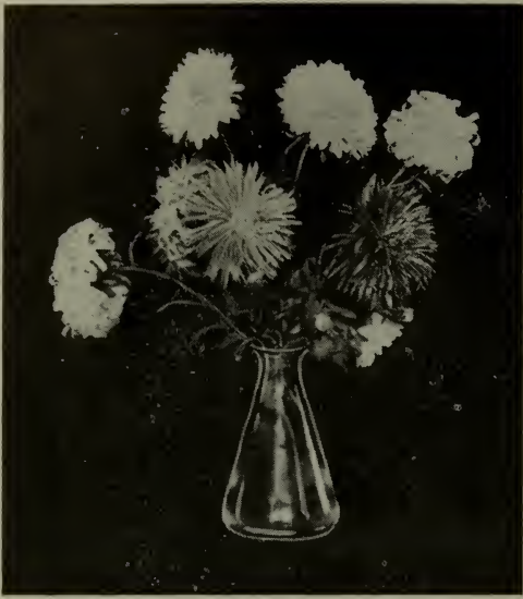
China aster (See under Callistephus ).