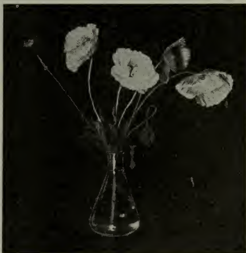
Annual poppy—French ranunculus variety. (See under Papaver ).