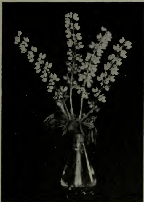
Lupines. (See under Lupinus ).