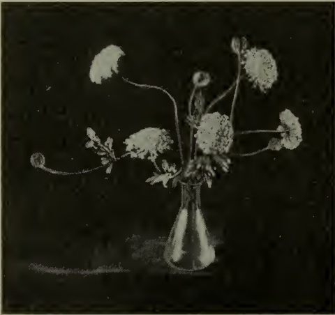
Didiscus cœrulea .