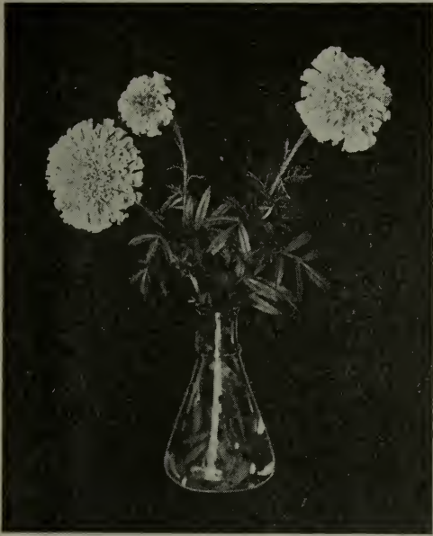
African marigold. (See under Tagetes ).