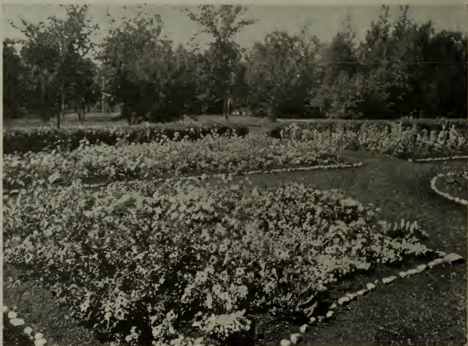
Petunias growing at the Dominion Experimental Farm, Indian Head, Sask.