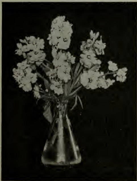
Ten-Week stocks. (See under Matthiola ).