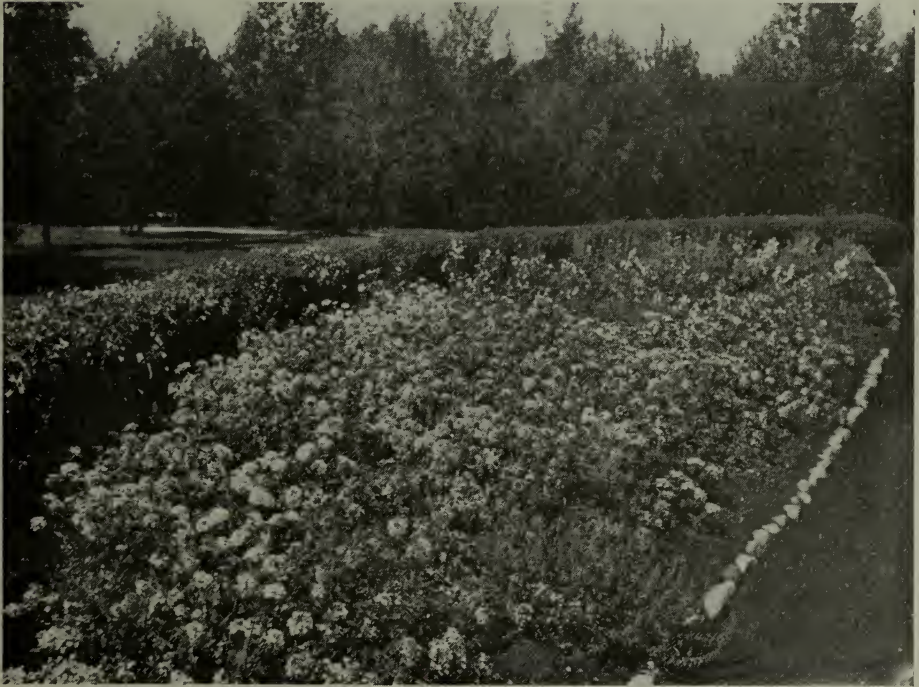
Verbena growing at the Dominion Experimental Farm, Indian Head, Sask.