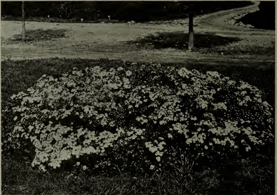
Phlox drummondii growing at the Dominion Experimental Farm, Brandon, Man.

Omphalodes linifolia Sanvitalia procumbens Sedum coeruleum