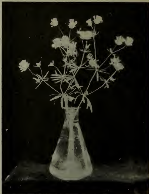
Asperula setosa .