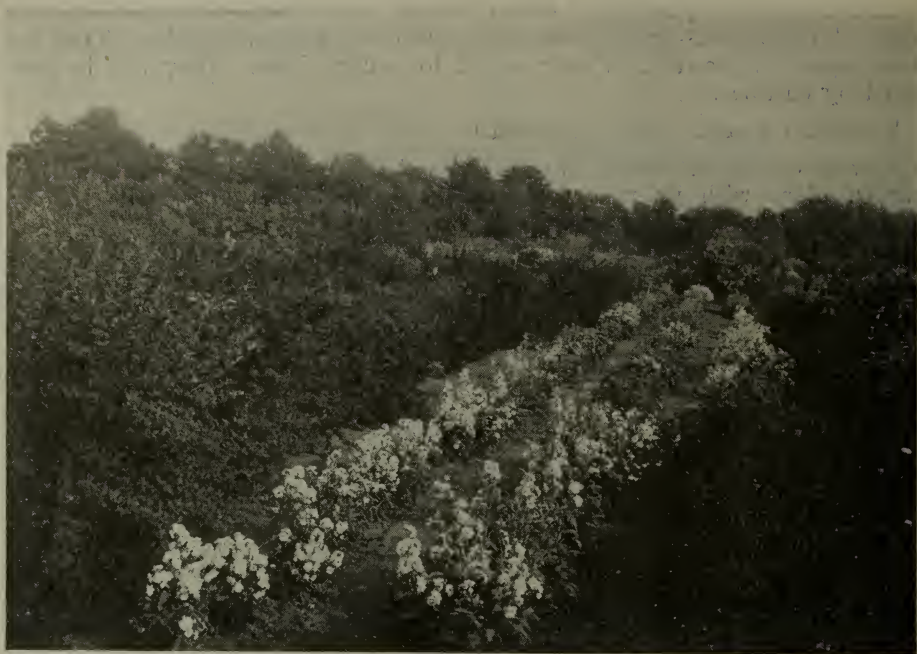
Ten-Week stocks growing at the Central Experimental Farm, Ottawa.