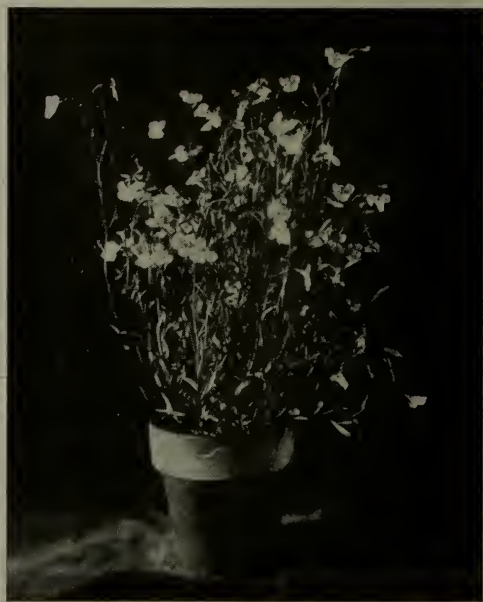
Lobelia tenuior .