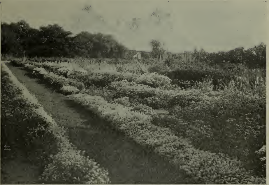
Annuals growing at the Central Farm, Ottawa. Showing part of the trial grounds where varieties and cultural methods are tested.