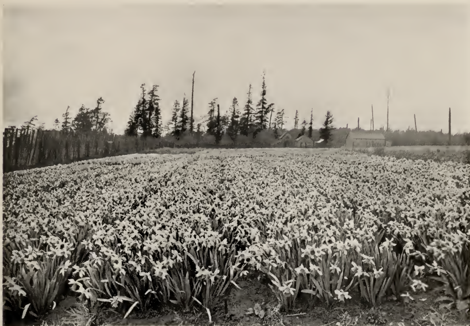
PLATE 2.—Narcissi in full flower, Bellingham, Wash.

erect or pendent, solitary or umbellate on the tops of the scape or peduncle, the spathe 1-leafed and membranous; perianth salver form, the tube varying in shape, the 6 segments equal or nearly so and ascending spreading or reflexed, the throat bearing a corona or crown which is long and tubular, or cup-shaped, or reduced to a ring; stamens 6, attached in the perianth tube, ovary 3-celled and the small stigma 3-lobed. The 6-parted perianth, 6 stamens with introrse anthers and inferior 3-celled ovary are together distinctive.