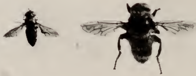
PLATE 5.—Narcissus bulb fly (right). Lesser bulb fly (left). (enlarged one-fourth)

Plot 4. Bulbs soaked in water. Bulbs soaked in water for 7 days; that 6.2 per cent Merodon appeared and 7 per cent Eumerus . A few bulbs had larvæ with heads appearing indicating that a longer period might be beneficial. Plot rogued in spring; 8.3 per cent of weak bulbs removed contained 2.1 per cent larvæ. Special plot soaked in water for 10 days; 9.7 per cent larvæ emerged. No larvæ found in spring.