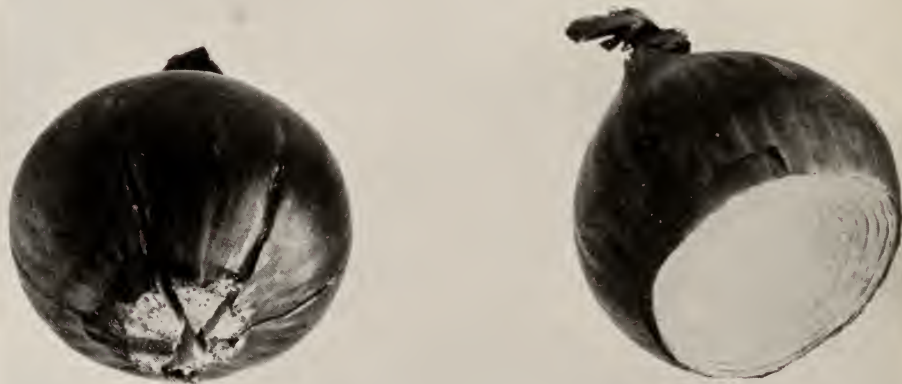
PLATE 9.—Scored and scooped hyacinth bulbs. Scored at left, scooped at right.

All scoring was done with a knife, from four to six cuts being made in the bulb according to size and shape. The scooping of the tulip and daffodil bulbs was done with a drill, while a knife was used for the same operation on the hyacinth bulbs. After scooping and scoring, the bulbs were set in moist sand in cold frames where they remained for 119 days, July 19 to November 16. At the end of this period they were lifted, the increase of bulblets were counted and then reset in the field to develop. The scoring process gave the greatest increase of bulblets with tulips and daffodils, while scooping gave the largest increase with hyacinths.