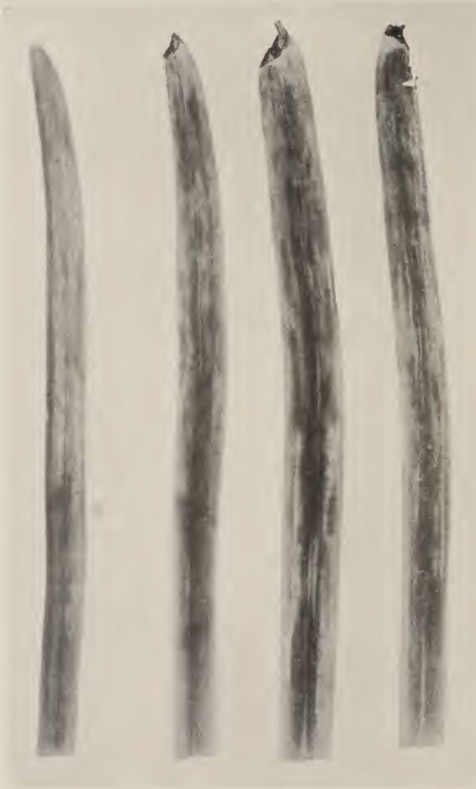
PLATE 18.—Leaves of the narcissus Lucifer showing mosaic-like mottlings.

This trouble is occasionally found in Narcissus plants. Plate 18 illustrates some leaves taken from the Incomparabilis variety Lucifer. The green colouring matter in the leaves is unevenly distributed causing a streaked appearance