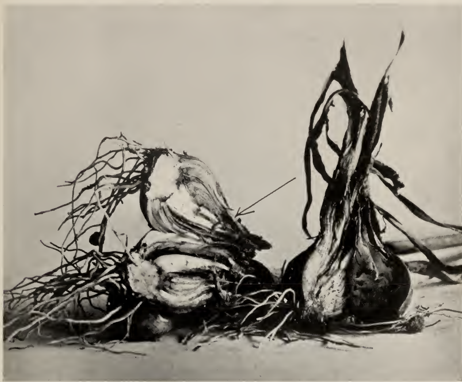
PLATE 4.—To illustrate larva of small narcissus bulb fly.

destroyed and is full of a semi-liquid decaying mass. The attack seems to begin at the neck and in mild cases the larvæ are found in the neck or under the scales at one side. The presence of many larvæ and the complete decay produced distinguishes the damage done by Eumerus from that done by Merodon . The larvæ or maggot of the small Narcissus Bulb Fly is about one-half inch in length when full grown, is greyish-yellow in colour and has a distinctly wrinkled appearance. The mouth parts are brown and the respiratory process at the front end are brownish red. The adult is about one-quarter inch in length, is blackish-green in colour with white marks on the side.