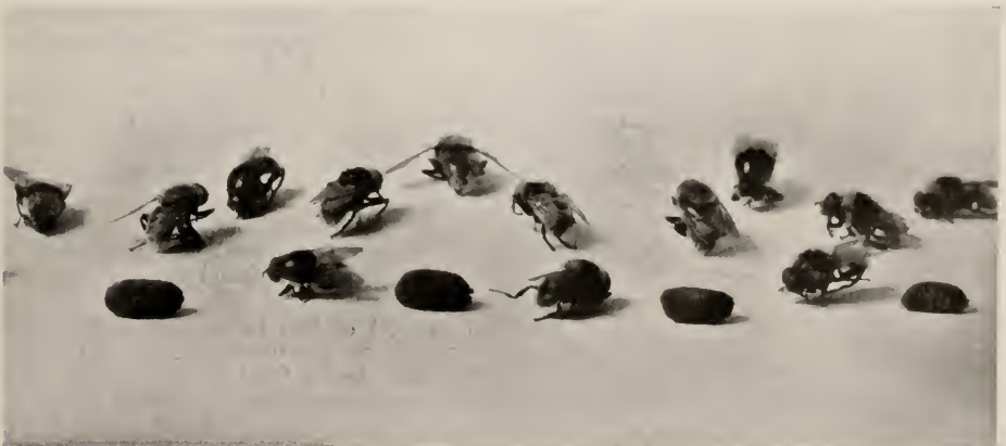
PLATE 6.—Pupa and adult large narcissus bulb fly. ( Meroden equestris ).