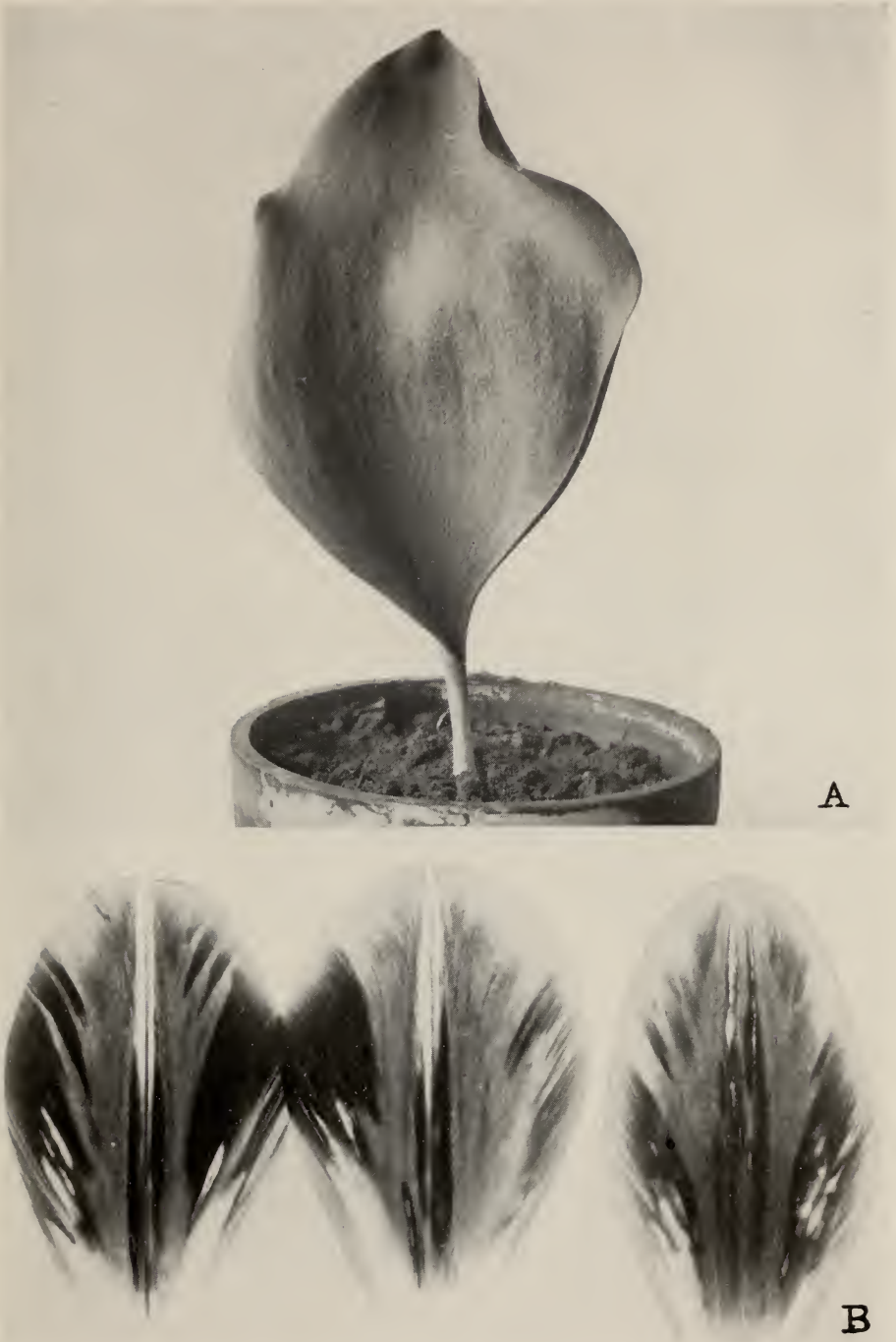
PLATE 15—Fig. A, "Blind Tulip." Fig. B, The petals of a broken cottage tulip of the variety Grenadier.