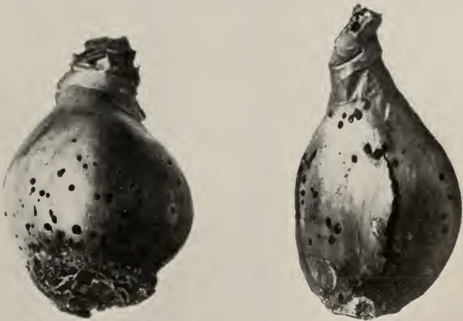
PLATE 17.—Narcissus plants and bulbs affected with a disease caused by the fungus Botrytis narcissicola Kleb.