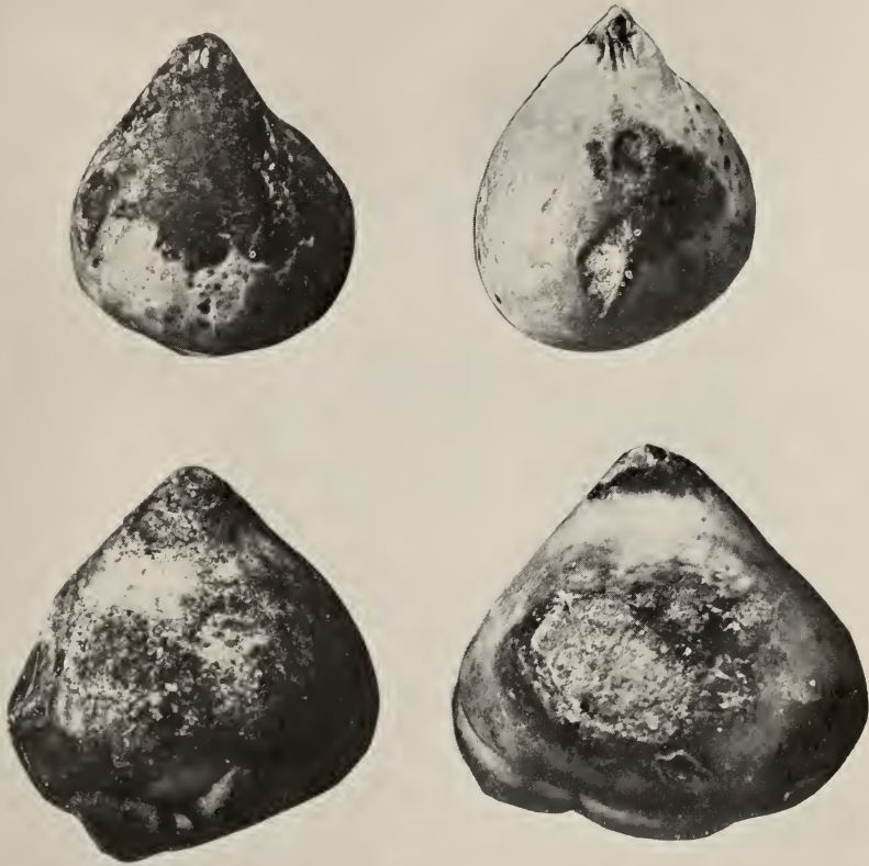
PLATE 14.—Blue mould decay of tulip bulbs after storage and transportation.

The first indication of the presence of this disease is observed in spring; planted bulbs either fail to grow or produce a plant which is stunted and soon dies. The bulbs when taken up are, in most cases, well rooted, but there is more or less dry decay beginning at the nose of the bulb, and the healthy white tissue is turned a greyish or reddish grey colour, which is the distinctive feature of this disease. The leaves and flower-shoot, if they have started, have rotted away often involving the adjacent bulb scales. The soil clings to the rotted areas of a diseased bulb, on account of the growth of the fungus into the soil. Loosely attached to the surface of the diseased tissue, embedded in the soil or between the rotted bulb scales, more or less globose and brown to black sclerotia are found. These vary in size from \frac{1}{16} to \frac{1}{4} inch in diameter. A felty layer of the mycelium of the fungus is present between the diseased scales.