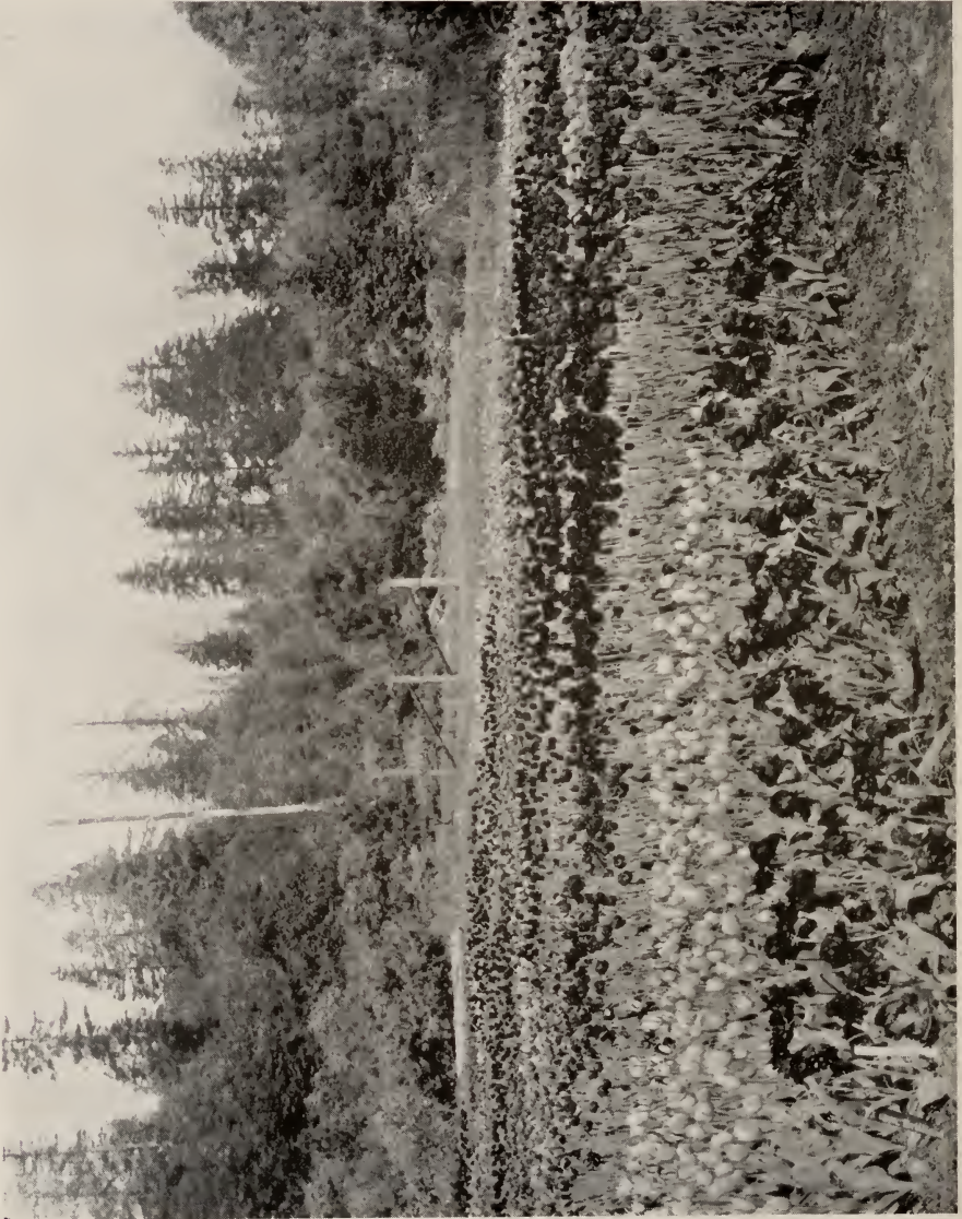
PLATE 1.—Tulips in full bloom, Experimental Station, Sidney, B.C.

the bulbs at the same depth, as otherwise they will not all bloom at the same time. In the colder parts of Canada, forest leaves spread over the beds serve as a protection during the winter, and are to be recommended, but are not needed on the Pacific coast. Various methods are followed in the making of the drills and covering the bulbs after being set. For this purpose we have found the hand plough of much use. In the spring it may be necessary to cultivate lightly to hold weeds in check, etc., but until after the blooming period little need be done.