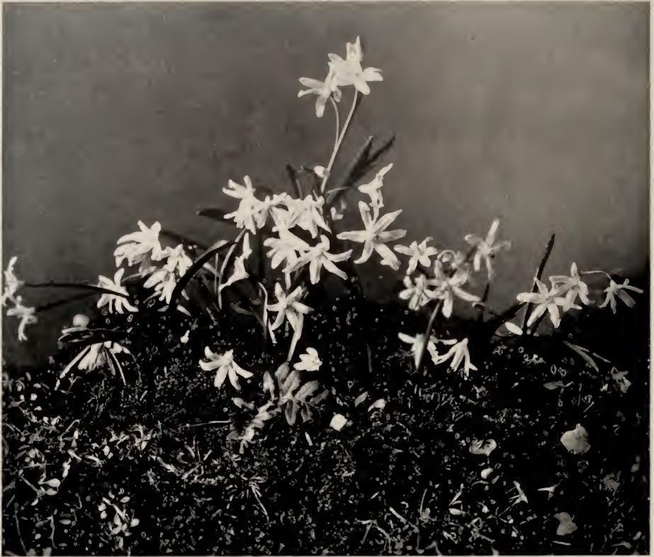
PLATE 10.—Chionodoxa—"Glory of the Snow".

White Lady. Immense pure-white hyacinth with compact spike. A sport of Lord Derby.