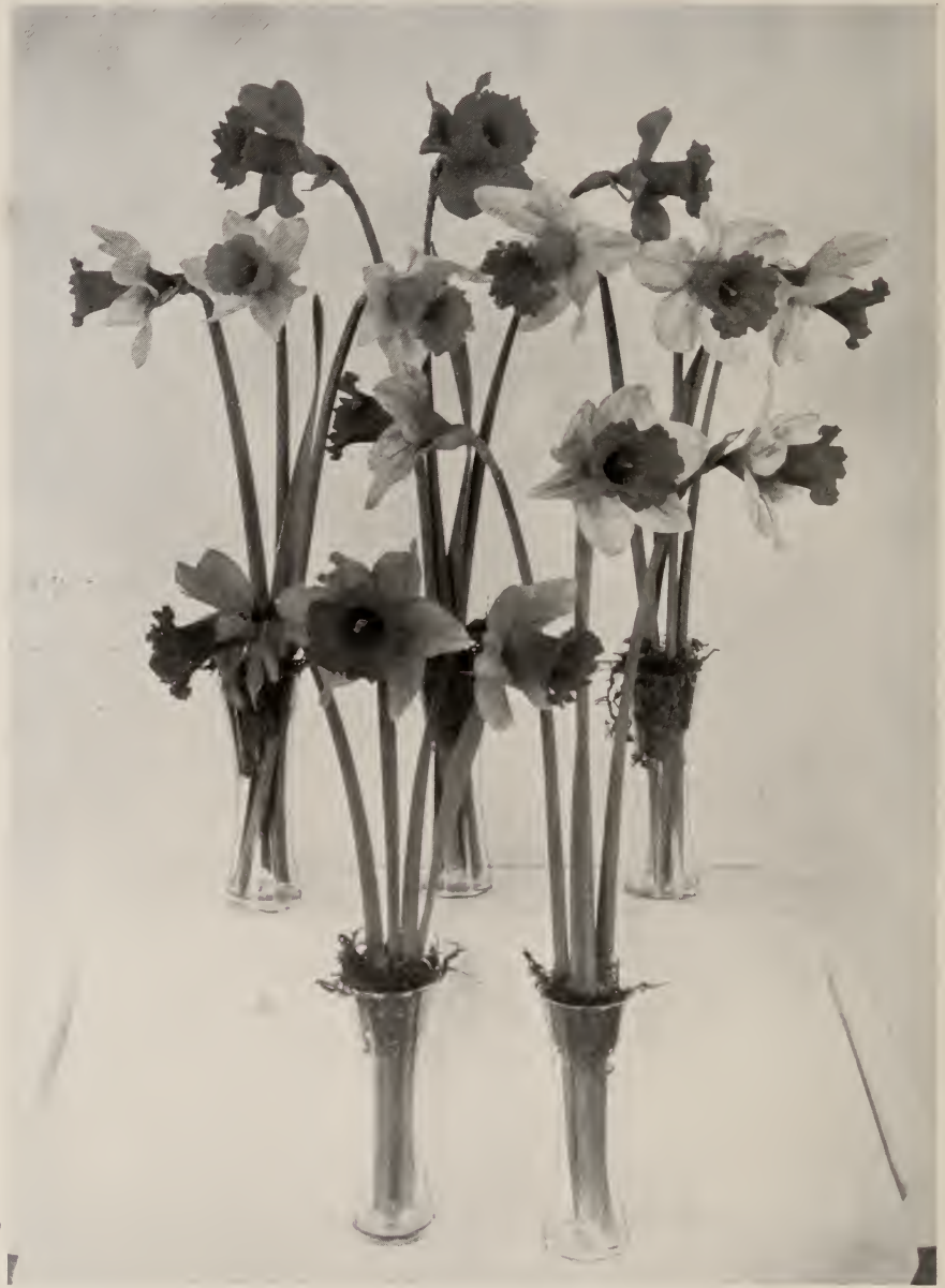
PLATE 7.—Collection of Narcissi. Upper, left to right: Weardale Perfection, King Alfred, Glory of Noordwijk. Lower: Olympia, Van Waveren's Giant.

Brigadier. Similar to Sir Watkin but of far superior form and finish; pure white perianth with a very large open cup of deep yellow; free-bloomer; a splendid daffodil.