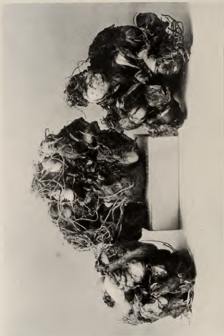
PLATE 8.—Daughter bulbs arising from “scooped” mother bulbs.

roots and the flower stalk has made two inches of growth. Water should be added from time to time to replace that lost by evaporation, but do not have the base of the bulb in the water. The move from darkness to bright light should be gradual, and a temperature of sixty degrees will be most satisfactory for water or moss culture. Bulbs forced under this system are exhausted and of no further use.