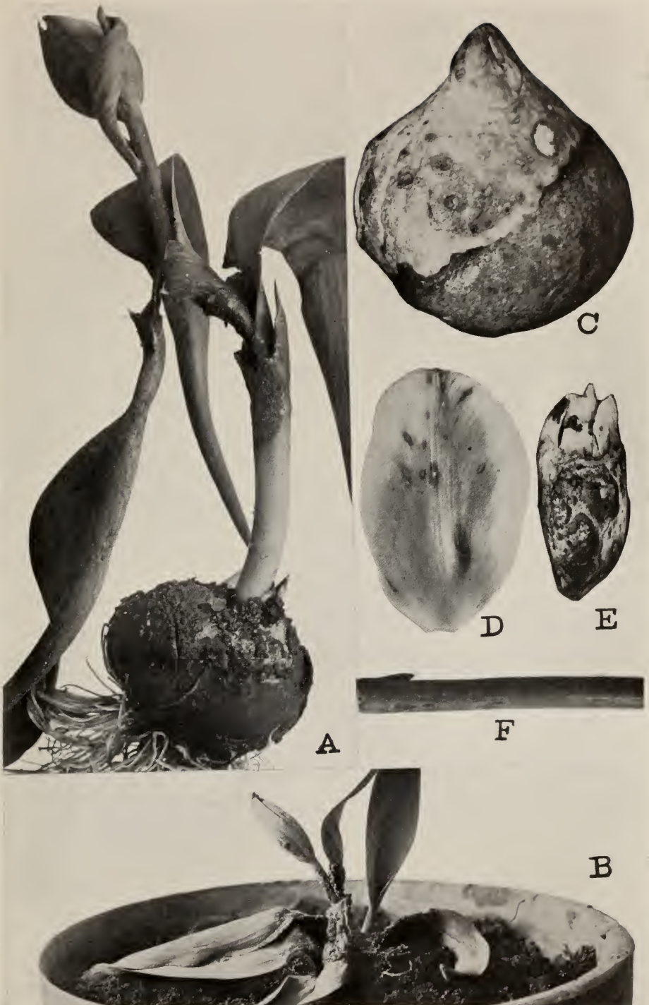
PLATE 13.—The Grey Mould Blight of Tulips ( Botrytis Tulipæ (Lib.) Hop.)