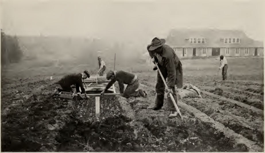
PLATE 3.—Planting daffodils at Bellingham, Wash.

Most daffodils do fairly well in shade, but it must not be too dense. In the flower border, to obtain the best effect, daffodils should be planted in large groups of irregular outline, each group or clump to contain one variety only. Avoid straight lines, circles and symmetrical designs. Masses of daffodils should always appear in the hardy flower border, where irregular and effective sweeps can be planted between the clumps of herbaceous plants, which in their turn grow up and hide as well as shelter the daffodil foliage while it is maturing the bulb.