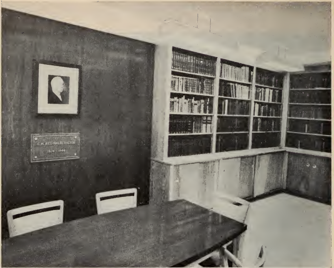
Part of the Buller Memorial Library Partie de la Bibliothèque commémorative Buller