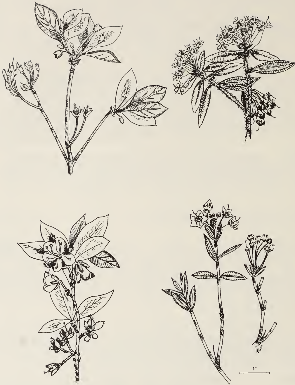
Fig. 14 Heaths: upper left, western minniebush; upper right, Labrador-tea; lower left, white rose-bay; lower right, bog-laurel.