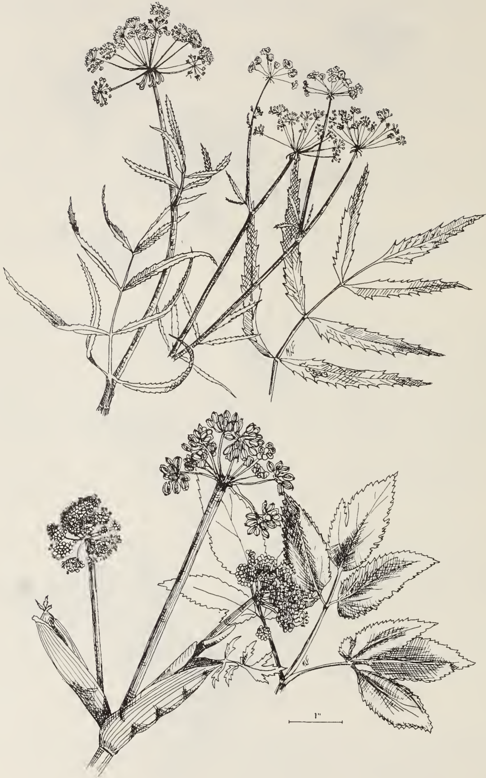
Fig. 11 Upper, water parsnip; lower, angelica sp.