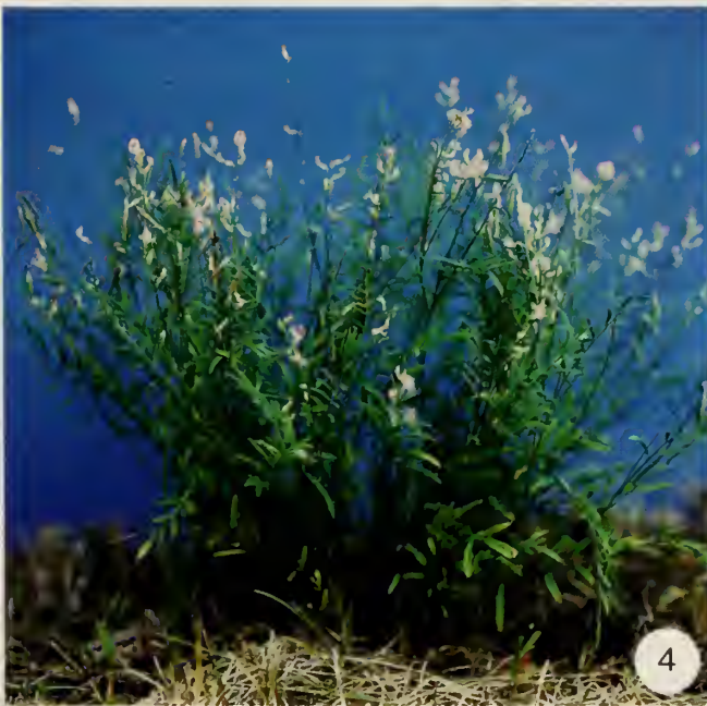
Fig. 1 Seaside arrow-grass. Fig. 2 Death camas. Fig. 3 Low larkspur. Fig. 4 Timber milk-vetch.