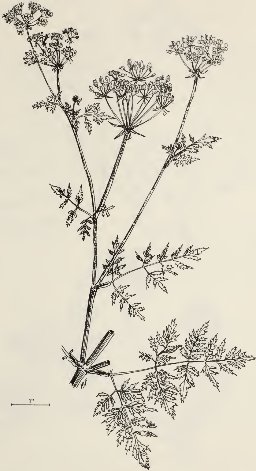
Fig. 10 Poison hemlock