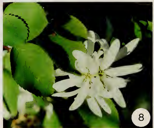
Fig. 5 Spotted water-hemlock. Fig. 6 Early yellow locoweed. Fig. 7 Choke cherry. Fig. 8 Saskatoon.