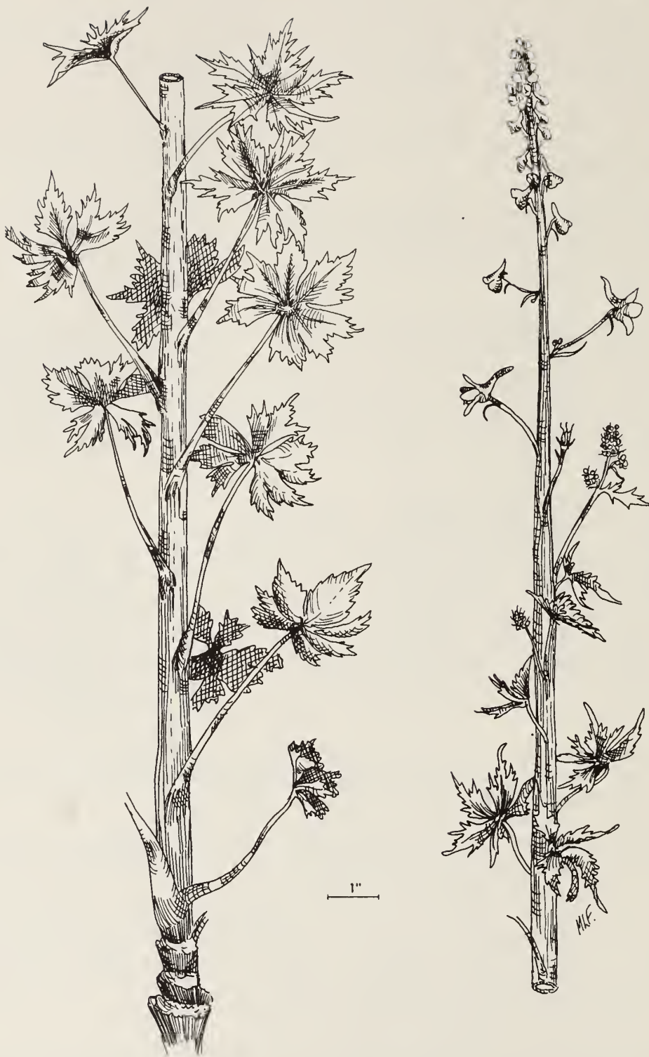
Fig. 9 Tall larkspur