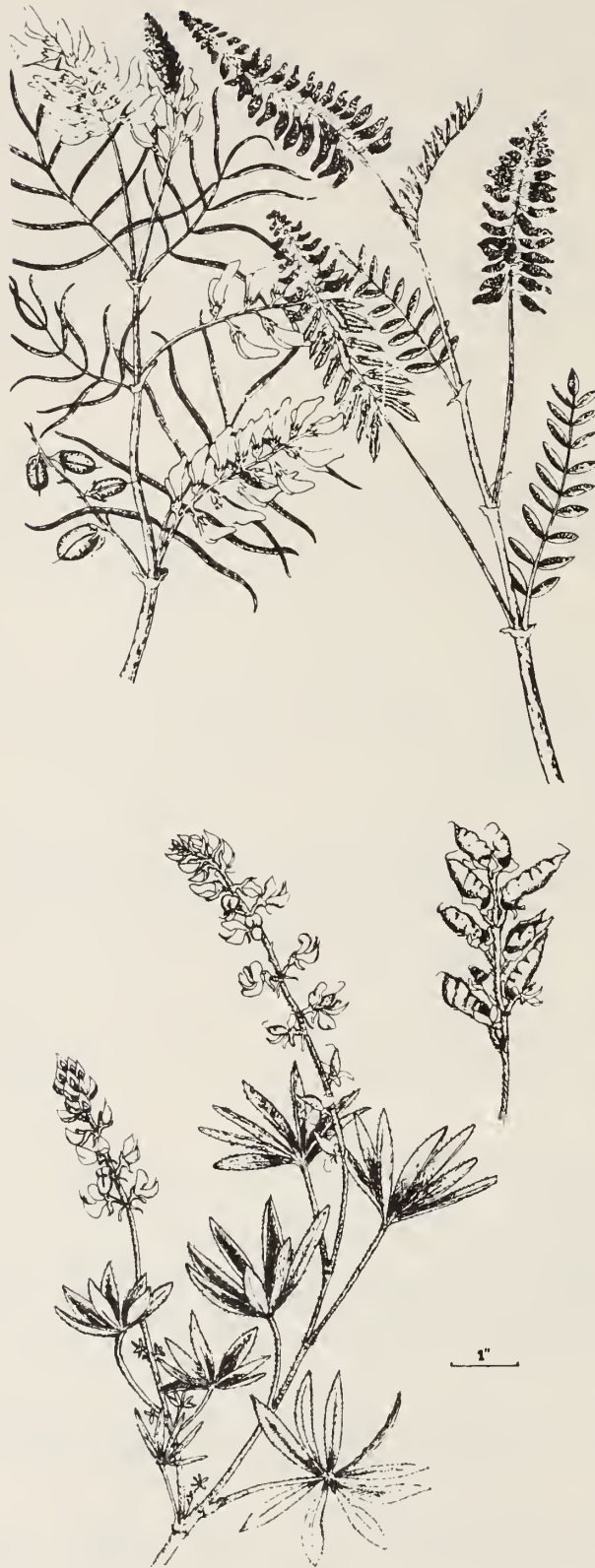
Fig. 12 Upper left, narrow-leaved milk-vetch; upper right, two-grooved milk-vetch; lower, silky lupine.