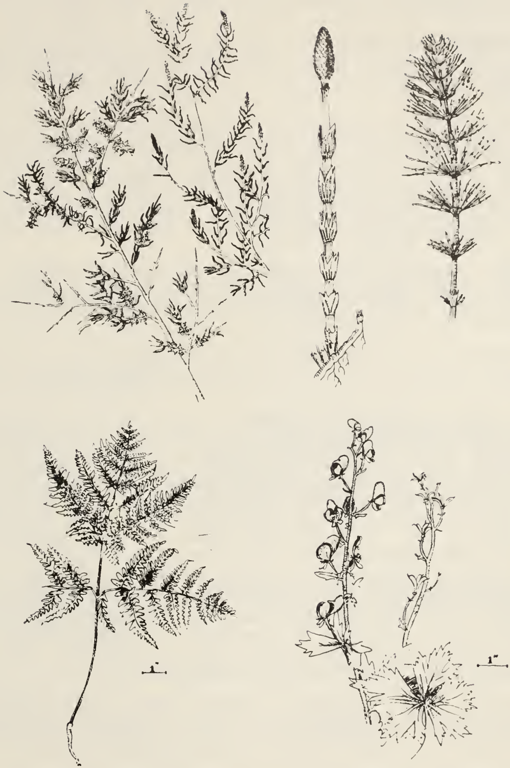
Fig. 13 Upper left, greasewood; upper right, horsetail sp.; lower left, bracken; lower right, monk's-hood.