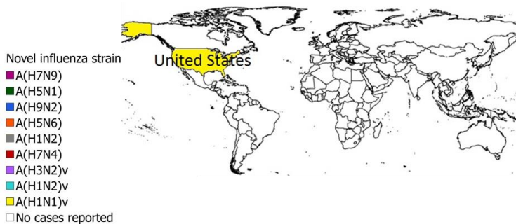
Figure 2. Spatial distribution of human cases of avian and swine influenza reported globally in May 2019 (n=1).

Note: Map was prepared by the Centre for Immunization and Respiratory Infectious Diseases (CIRID) using data from the latest WHO Monthly Influenza at the Human-Animal Interface Risk Assessment. This map reflects data available through these risk assessments as of May 31, 2019.