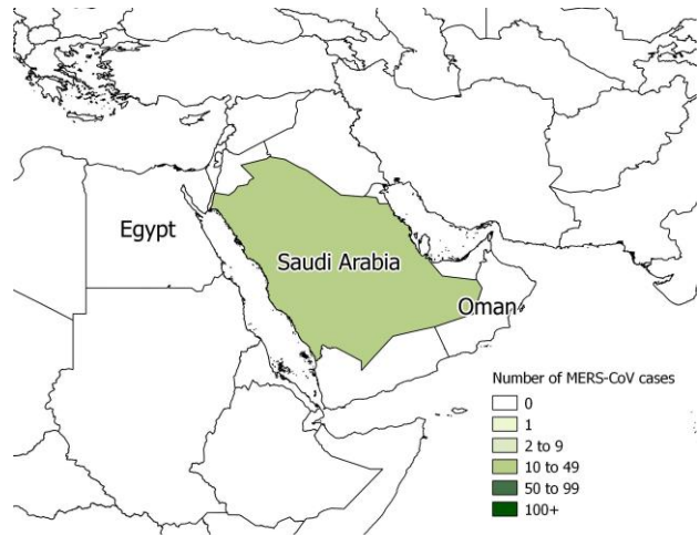
Figure 3. Spatial distribution of human cases of MERS-CoV reported in May 2019 (n=14).

Note: Map was prepared by the Centre for Immunization and Respiratory Infectious Diseases (CIRID) using data from the latest WHO Disease Outbreak News and Saudi Arabia's Ministry of Health. This map reflects data available through these risk assessments as of May 31, 2019.