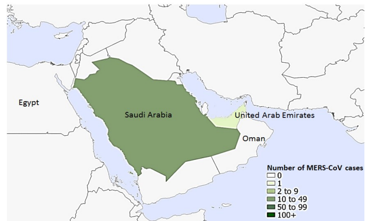
Figure 2. Spatial distribution of human cases of MERS-CoV reported in October 2019 (n=14).

Note: Map was prepared by the Centre for Immunization and Respiratory Infectious Diseases (CIRID) using data from the latest WHO Disease Outbreak News and Saudi Arabia's Ministry of Health. This map reflects data available through these risk assessments as of October 31, 2019.