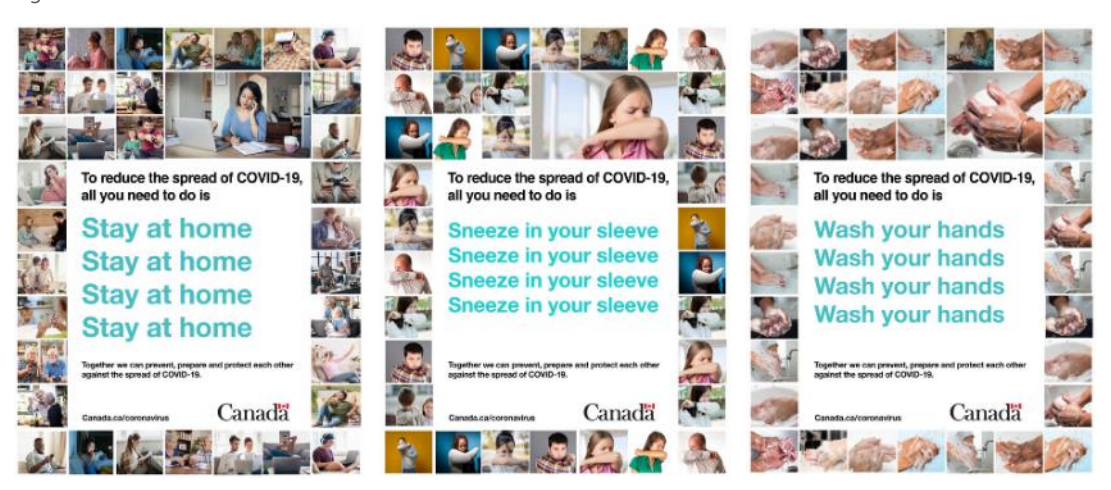
Figure 7: Print

Figure 7 features three print ad concepts. Each concept features a collage of square shaped images (35 per ad) of Canadians showing different ways they can protect themselves from COVID-19. In the first ad, Canadians are staying at home, in the second they are sneezing into their sleeve and the third ad shows multiple people washing their hands. There is a large white square in the center of each ad, with text that reads: "To reduce the spread of COVID-19, all you need to do is". Then the action ("stay at home", "sneeze into your sleeve", or "wash your hands") is written below in large blue font, repeating four times. Following this, text says: "Together we can prevent, prepare and protect each other against the spread of COVID-19." The website URL "Canada.ca/coronavirus" and the Canada Wordmark are shown on the bottom of each ad.