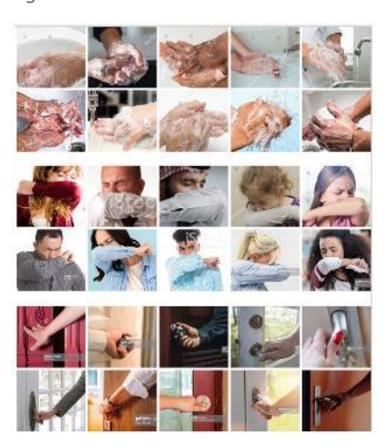
Figure 6: Television

The concept show in Figure 6 is a storyboard of images that could be used to make up a television ad. The four-part series sequence starts with someone washing their hands, then switches to another person watching their hands and repeats with different individuals washing their hands. Then, in the same way, we see duplicating images of Canadians demonstrating other ways they can help prevent the spread of COVID-19 including sneezing and coughing into the sleeve and touching door handles.