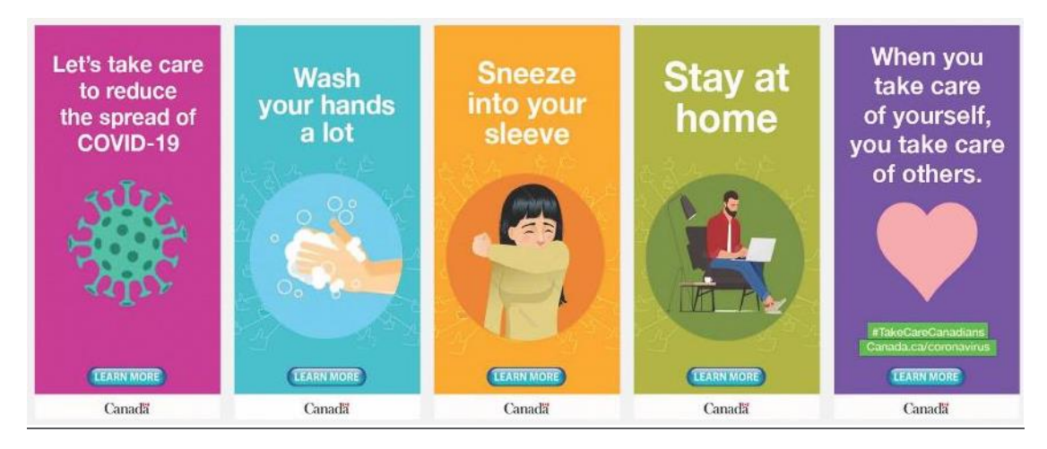
Figure 11: Web Banner

The storyboard shown in Figure 11 begins with a cartoon version of the microscopic image of the virus, along with text "Let's take care to reduce the spread of COVID-19". The ad then progresses through three main frames. Each frame is a different bright colour and features a large circle in the middle, with an animated image showing different ways Canadians can protect themselves from COVID-19. At the top of each frame, text with the ways Canadians can help to reduce the spread is presented. The first frame reads "wash your hands a lot", the second "sneeze into your sleeve" and the third reads "stay at home". The ad finishes with a frame that which reads: "When you take care of yourself, you take care of others" along with an icon of a heart in