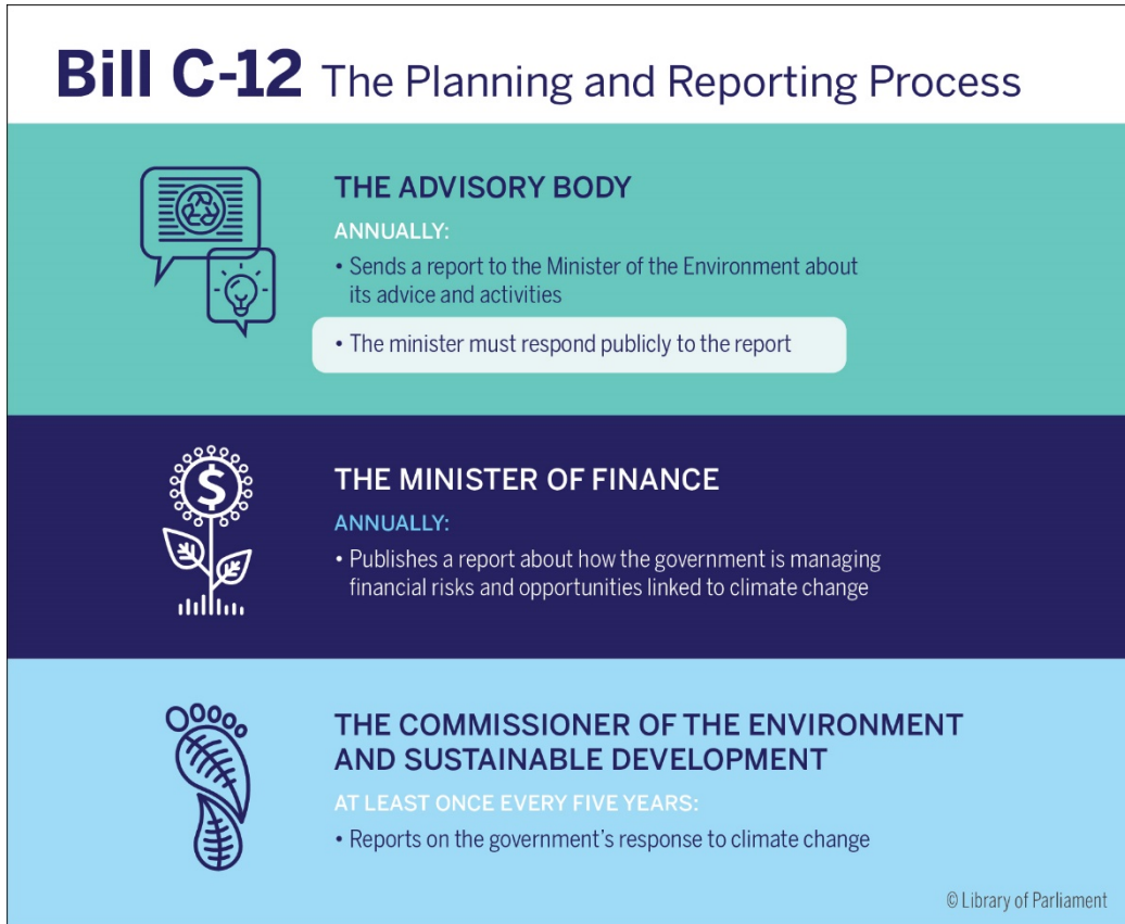
Figure 2 – Reporting Process Followed by the Advisory Body, the Minister of Finance and the Commissioner of the Environment and Sustainable Development