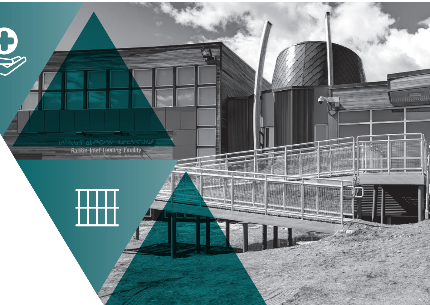
ᑲᑭᑭᑦᑲᑦᑲᑦ ᐃᑲᑲᑦᑲᑦ ᐃᑲᑲᑦᑲᑦ Rankin Inlet Healing Facility