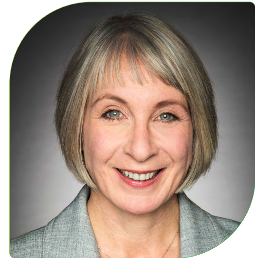
THE HONOURABLE PATTY HAJDU PC, MP Minister of Health

Canada faces many health challenges, and those challenges are often felt most acutely by the most vulnerable members of our society. By investing in research today, we will create the knowledge we need to find lasting, evidence-based solutions that benefit all people across Canada and throughout the world. On behalf of the Government of Canada, I invite Canadians to read this Strategic Plan to learn more about CIHR and its vision for improving our health today and for generations to come.