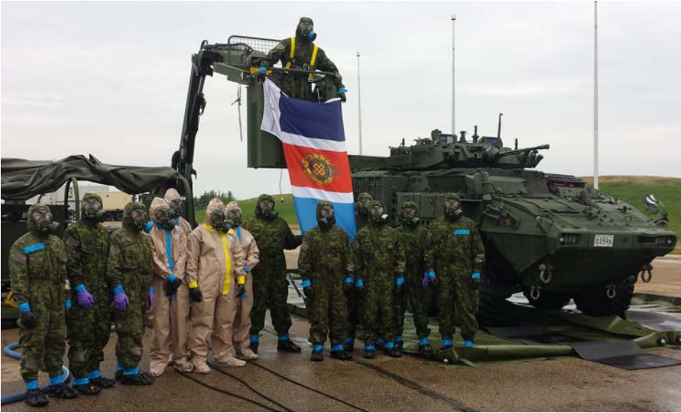
Logisticians from the DECON unit in Edmonton.