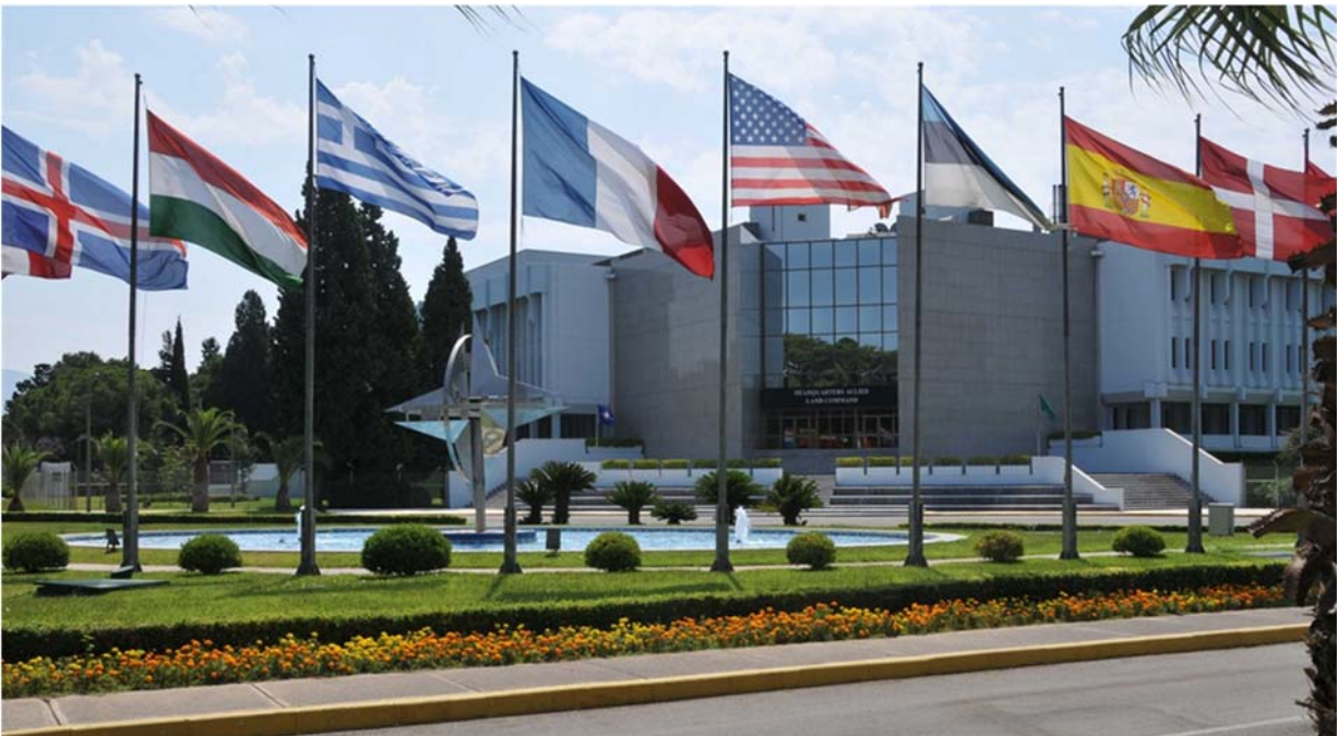
NATO LANDCOM HQ, Izmir, Turkey