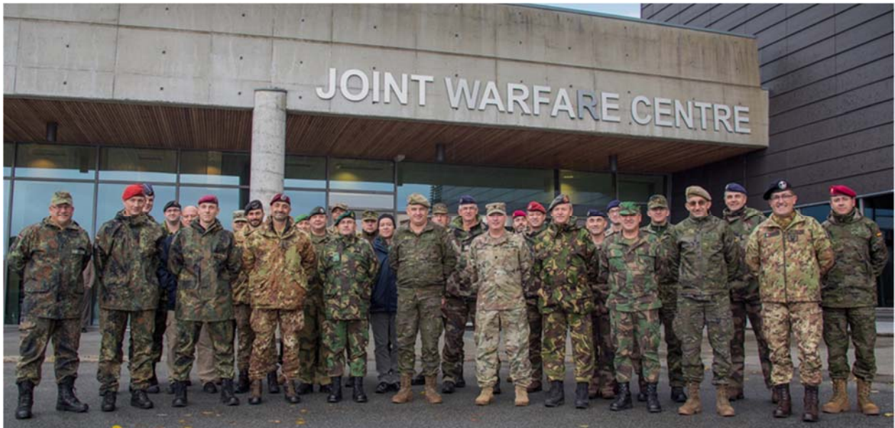
NATO LANDCOM HQ G4 Division, including augmentees during Exercise Trident Javelin 2017 held at the Joint Warfare Center in Stavanger, Norway.