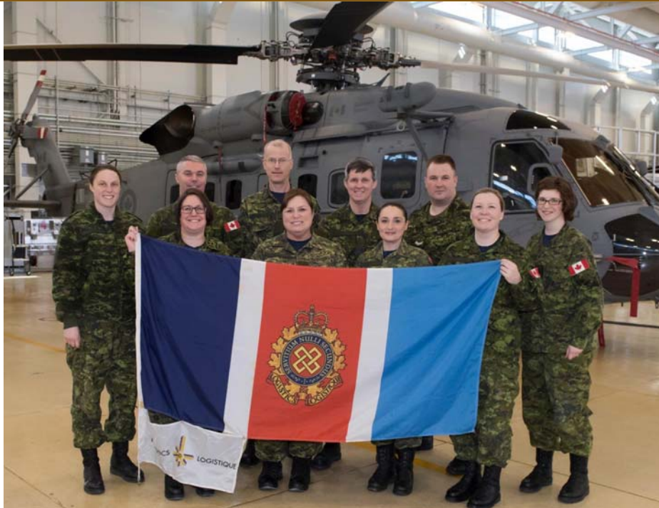
Many of the Logisticians who provide critical support to Operations at 12 Wing Shearwater.