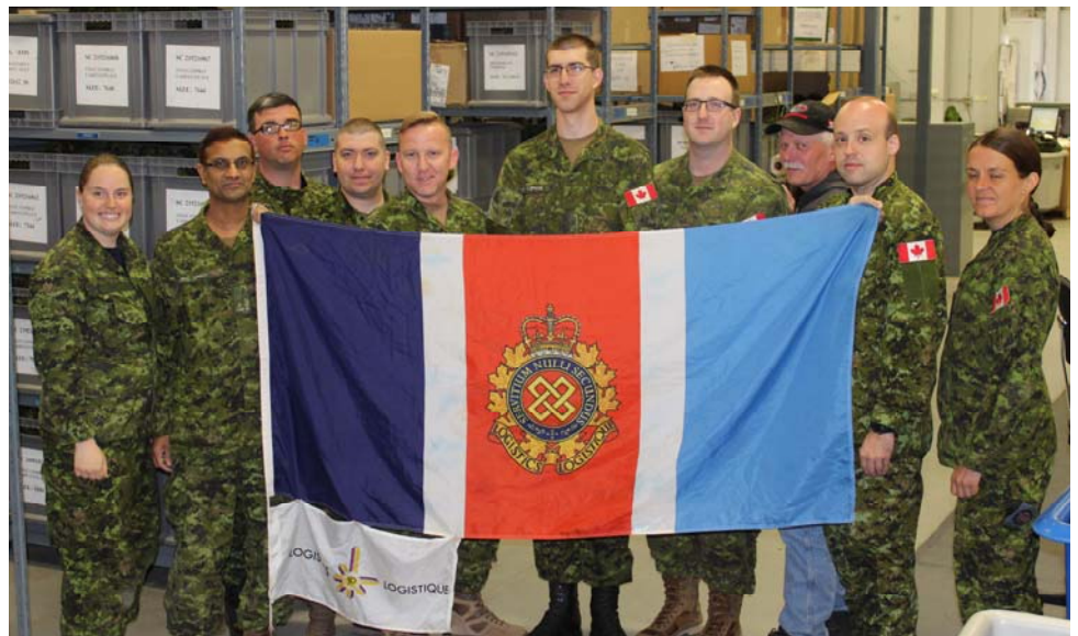
More proud Logisticians from Edmonton.