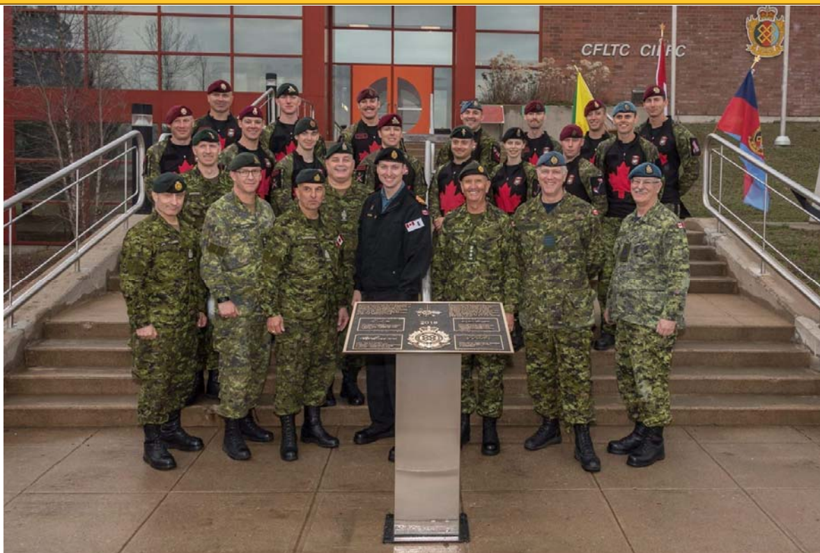
Group photo during the 50th Anniversary of the Logistics Branch of the unveiling ceremony at CFLTC Borden Headquarters on May 2, 2018 at CFB Borden.