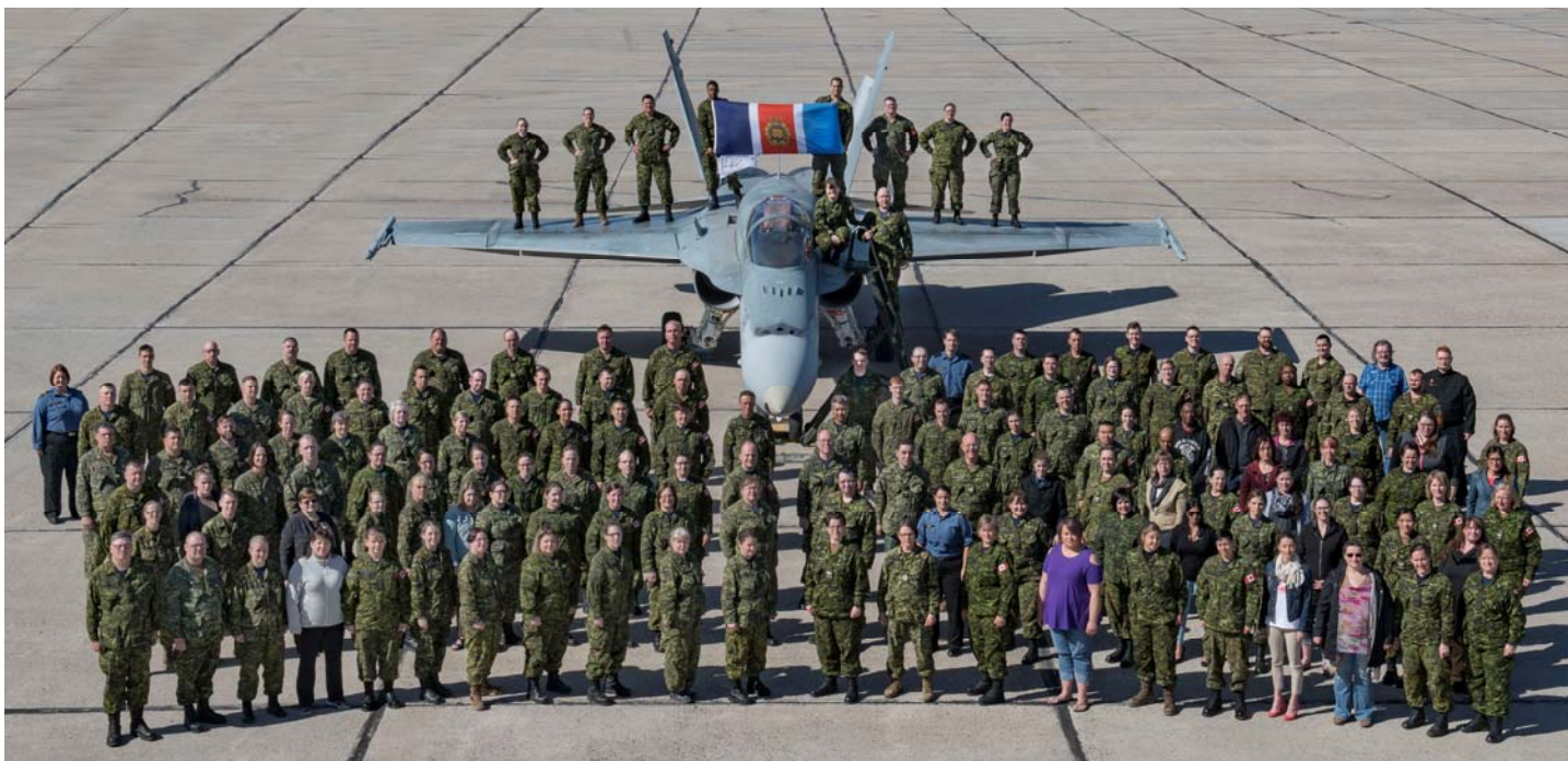
Just some of the many Logisticians who support activities on Canada's largest fighter base enjoying their time in the sun with our 50th Anniversary Flag.