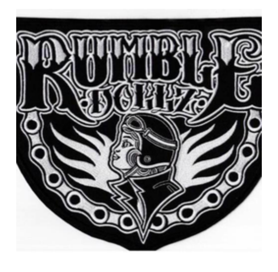
Services Class 41 motorcycle clubs