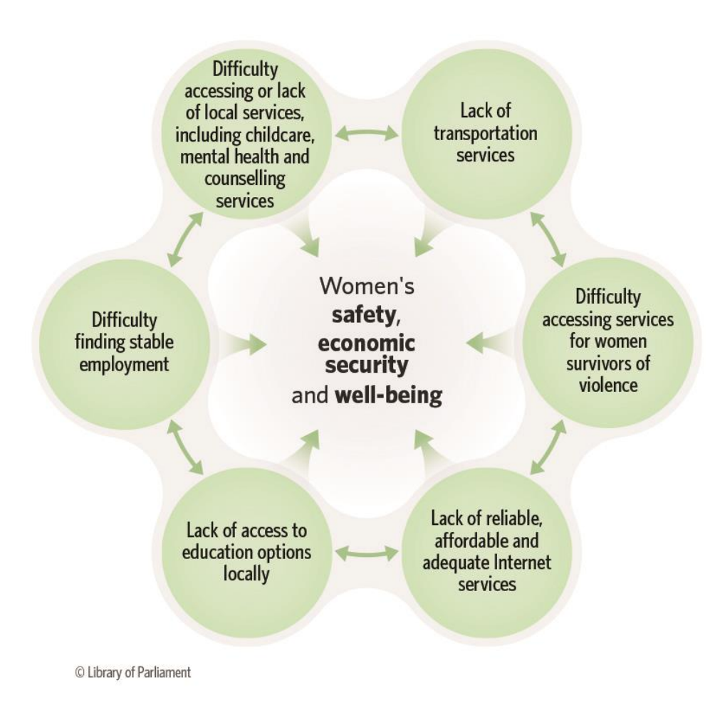
Figure 1—Selected Factors That Affect the Safety, Economic Security and Well-Being of Women Living in Rural, Remote and Northern Communities