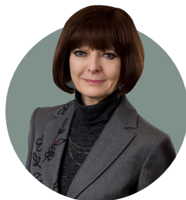
Sharilyn J. Ingram Chair, Canadian Cultural Property Export Review Board 344 Slater Street, 15 th Floor, Suite 400 Ottawa, ON K1A 0E2

The Honourable Steven Guilbeault Minister of Canadian Heritage 15 Eddy Street Gatineau, QC K1A 0M5