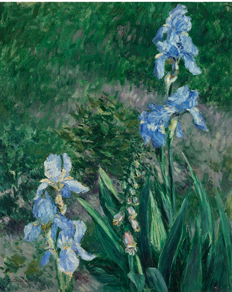
Iris bleus, jardin du petit Gennevilliers , 1892, by Gustave Caillebotte, acquired by the Art Gallery of Ontario