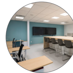
Ilihimaniq Aadlanut Uqaqatigiivik

CHARS nayugangani nunaryuaptikni-katimayunik havakvik qitqanilu munariyukhanik ihivriunniqmut unalu ilihimaniq pipkaidjutininnaga. Akhuurutauyuq tunngavik havaqatigiikniqmut Nunavuutim Kitikmeonut, tamna nayugangani tunngahuktittiyut ihivriunniqmut tamainnit nunaryuaptiknit havaqatigiiani Kitikmeonmut ayuittiaqtut uumunnga ihuarhiyuq kangirhininnaga nunanngani qanuqtullu aadlanguligtuq.