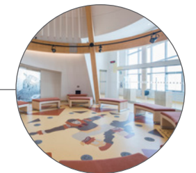
Nunanngani Naunaitkutariniqmut Qanuriliurutingit (GIS) havakvinga