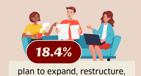
or acquire or invest in other businesses