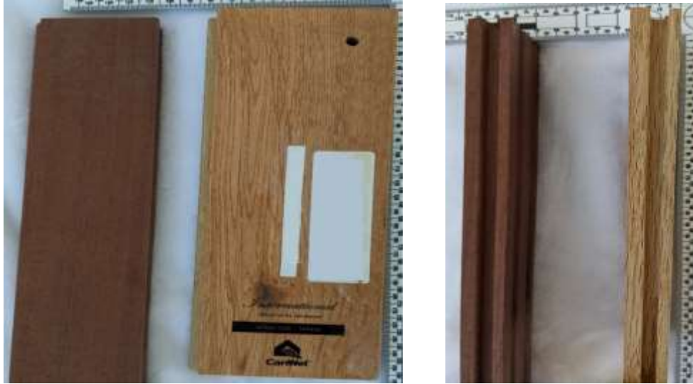
Image 2. Plywood of Heading 44.12 – Photo of a plywood panel with one top ply sheet facing up, and a second photo of the multi-ply wood panel cross section.

Image 1. Wood strip flooring of heading 44.09 - Photo of two samples of wood strip flooring panels, each composed of one strip facing up, and a second photo of the side view of the two wood strip panels' tongue and groove edges.