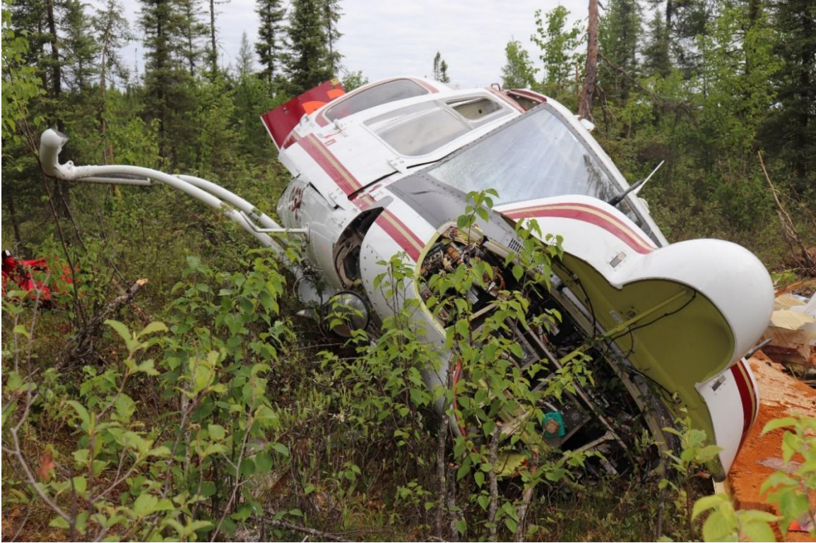
Figure 1. The occurrence aircraft during recovery preparations