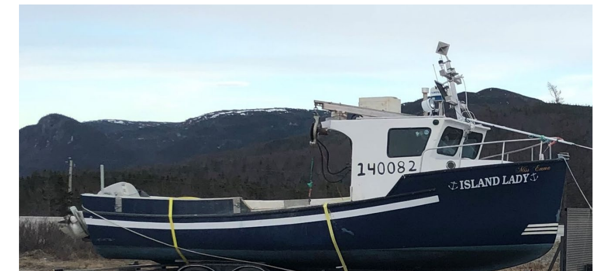
Figure 1. The Island Lady

In addition to the fitted equipment, the vessel normally carried 2 insulated fish totes, hand totes containing ice, and spare gas cans. The vessel also carried life jackets, 2 immersion suits, a life ring, and flares.