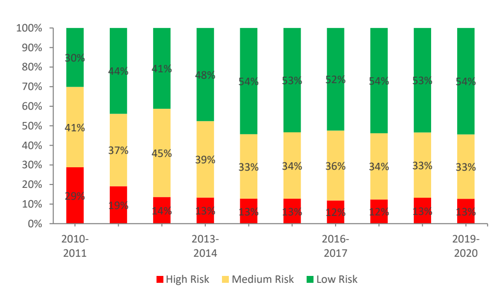
Figure 2-2 Share of W&WW Risk Rankings, All Regions

Sources: PBO calculations based on data from Indigenous Services Canada and the National Assessment of First Nations Water and Wastewater Systems (Regional Reports).