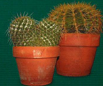
Many plants, including all Cacti, Orchids and American Ginseng, are protected.

If CITES-listed wildlife is imported into Canada, exported from Canada, or attempted to be exported without the necessary permits, those goods or specimens are subject to seizure and forfeiture, and the importers/exporters are liable to prosecution.