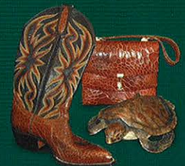
Many reptiles and amphibians are also protected.