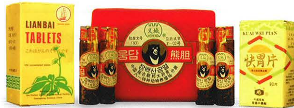
Some medicine and food products contain parts of CITES-protected plants and animals.

All cats, except for the domestic cat, are protected under CITES. Many spotted cats are Appendix I species.