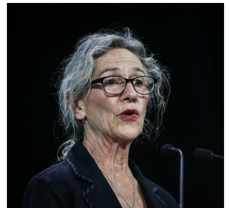
The Honorable Joyce Murray, Minister of Fisheries, Oceans and the Canadian Coast Guard presenting at a high level Ocean Decade Alliance event.

More than 6000 participants from about 150 countries gathered in Lisbon, Portugal from June 27 to July 1, 2022 for the United Nations Ocean Conference (UNOC) to unpack ocean issues and explore concrete actions to ensure a healthy and sustainable ocean for the future. A key outcome of UNOC was the adoption of the Lisbon Declaration , which focuses on the importance of scaling up innovative science-based solutions to achieve Sustainable Development Goal 14 Life Below Water and also recognizes the importance of the Ocean Decade for sustainable development. In support of the overarching theme to scale up action based on science and innovation, the Ocean Decade took a central place in the discussions.