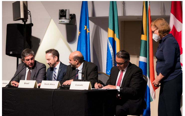
The Parliamentary Secretary to the Minister of Fisheries, Oceans and the Canadian Coast Guard, Mike Kelloway, signing the All-Atlantic Ocean Research and Innovation Declaration on behalf of Canada.

The All-Atlantic Ocean Research and Innovation Alliance (AAORIA) is the result of science diplomacy efforts involving countries from around the Atlantic Ocean to enhance marine research and innovation cooperation. The All-Atlantic Ocean Research Forum 2022 was co-hosted by Brazil and the United States and included a Scientific Event (May 31 to June 2, 2022; Brasilia) followed by a high-level Ministerial Event (July 12-14, 2022; Washington, DC).