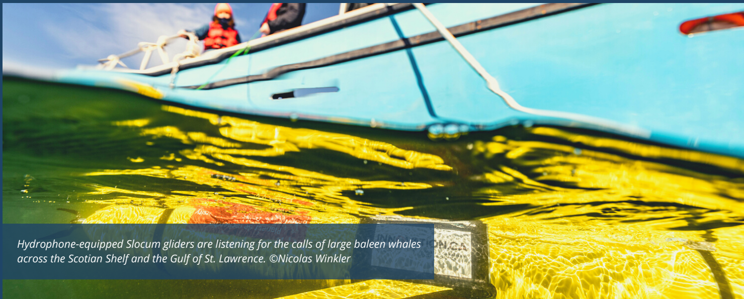
Hydrophone-equipped Slocum gliders are listening for the calls of large baleen whales across the Scotian Shelf and the Gulf of St. Lawrence.