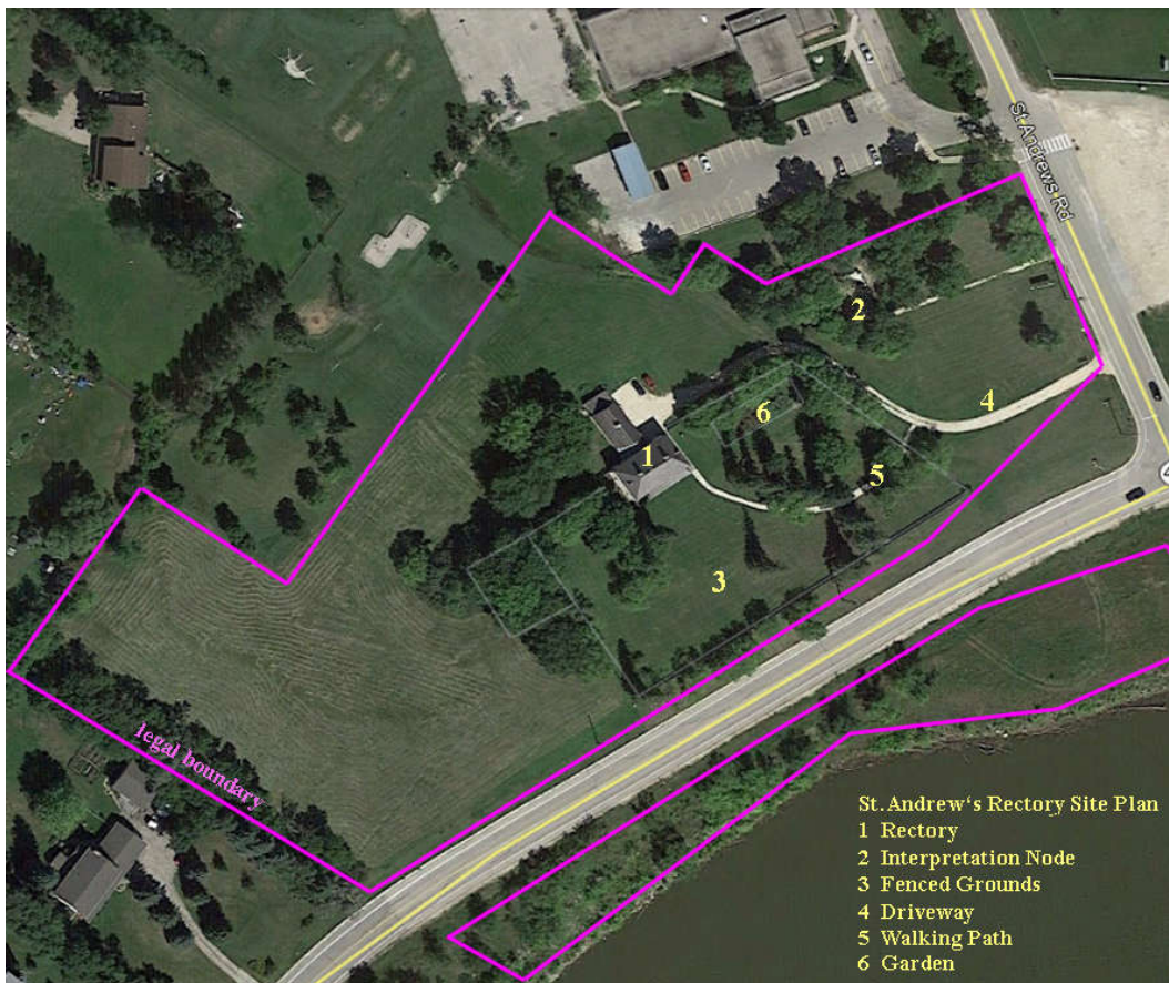
Map 2. St. Andrew's Rectory National Historic Site. Parks Canada 2021.