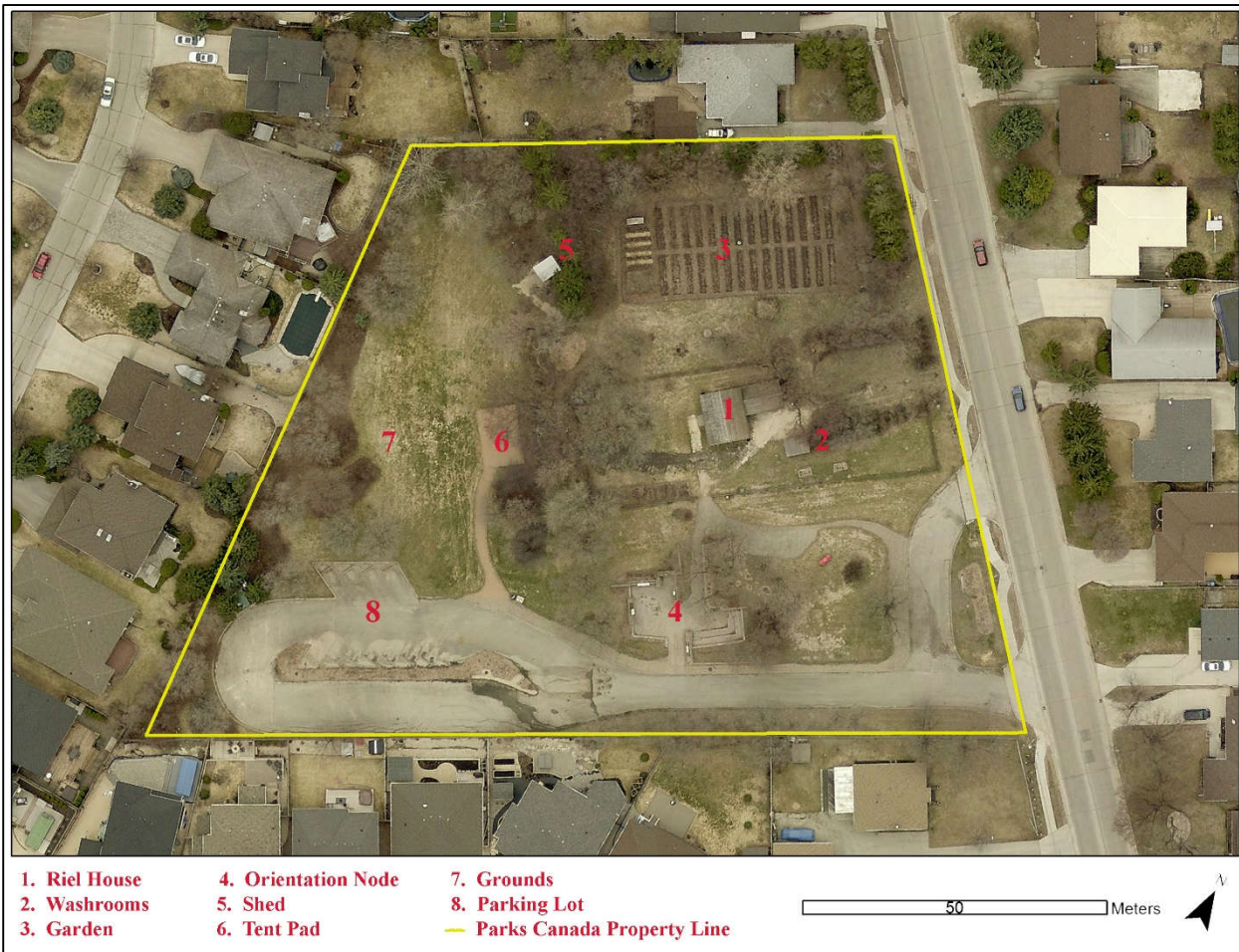
Map 2. Site plan of Riel House National Historic Site