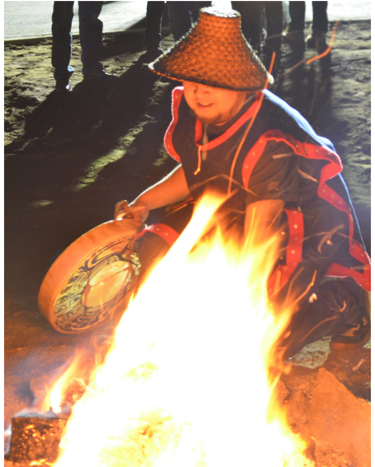
Midnight transition on Effective Date April 5th, 2016.