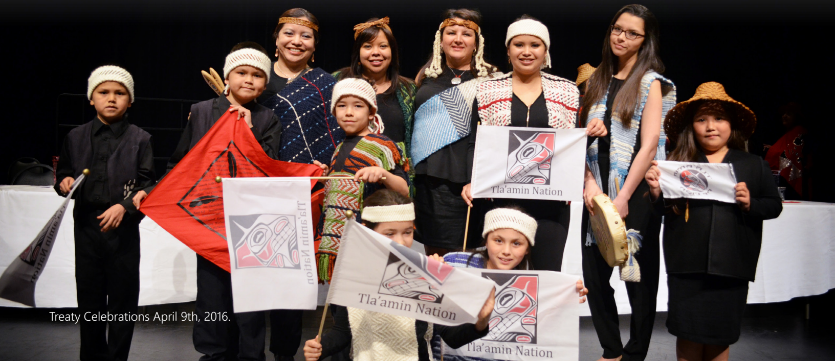
Treaty Celebrations April 9th, 2016.