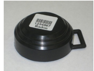
Figure 1. Alpha Track Detector.

These detectors use a small piece of special plastic inside a container with a small defined opening. When radon enters the opening in the detector, the alpha radiation causes damage tracks on the plastic; the number of tracks is proportional to the radon concentration. At the end of the test period, the container is returned to a laboratory for reading.