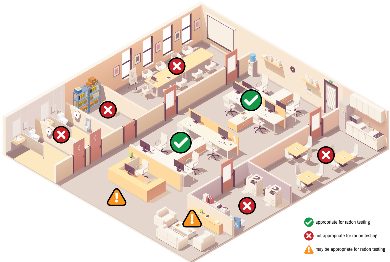
Figure 3. Potential radon testing locations in an office environment. Locations that may be appropriate (⚠️) should be assessed to ensure that detectors will not be disturbed if they are placed in these locations.

Examples of rooms and locations that are appropriate for radon testing are illustrated in Figure 3 and Figure 4.