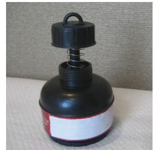
Figure 2. Electret Ion Chamber.

This device consists of a special plastic canister (ion chamber) containing an electrostatically charged disk detector (electret). The detector is exposed to radon in the air during the measurement period. Ionization resulting from the decay of radon produces a reduction in the charge on the electret. The drop in voltage on the electret is related to the radon concentration. The detectors may be read using a special analysis device to measure the voltage or mailed to a laboratory for analysis. The detectors are sensitive to the prevailing background gamma dose rate and the results need to be corrected for this by making an onsite gamma dose rate measurement. This type of detector may be deployed for 1 to 12 months.