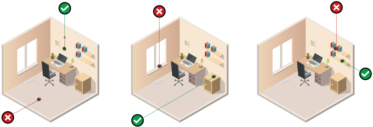
Figure 4. Potential testing locations in an office. Locations that are appropriate (✓) for radon testing and locations that are not appropriate (✗) for radon testing are indicated.