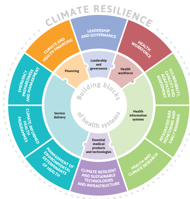
FIGURE 3. WHO operational framework for building climate resilient health systems. 12

Climate change threatens the safety and integrity of these people, organizations and facilities and has the potential to disrupt the established arrangements that govern the functioning of health systems. This may result in direct and indirect impacts to the health of Canadians. The WHO has developed an operational framework 10 , illustrated in Figure 3, to assist health systems with fostering resilience to climate change within their programming and planning. This step incorporates information presented as part of this framework, as well as information tailored to the Canadian context, such as information that may help public health authorities better serve Indigenous Peoples 11 . Completing this step will help assess how climate change may impact your health system as whole and assist in identifying possible adaptation options to reduce or prevent these impacts.