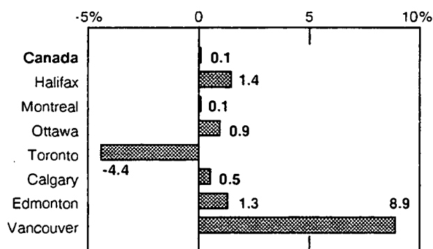
Percentage Changes in New Housing Price Index from Same Month of the Previous Year, Canada and Selected Cities, June 1992

The largest monthly increases were registered in Ottawa-Hull (0.9%), Sudbury-Thunder Bay (0.9%) and Vancouver (0.7%). The largest monthly decrease was recorded in Kitchener-Waterloo (-0.4%).