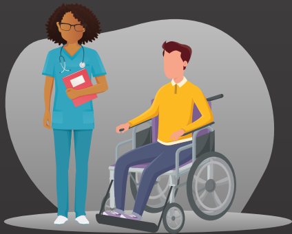
Registered nurses and registered psychiatric nurses

In 2016, the most common care occupations were: