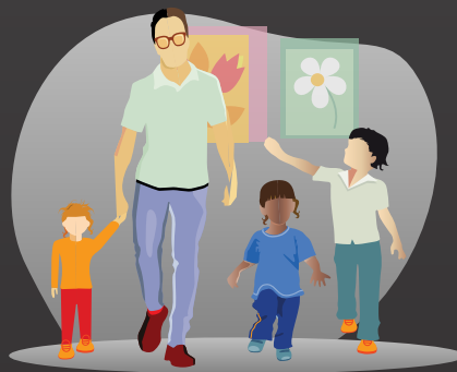
Elementary school and kindergarten teachers