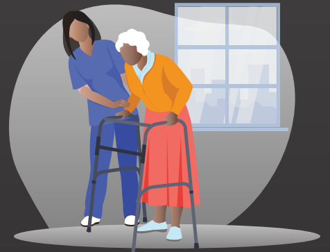
Nurse aides, orderlies and patient service associates