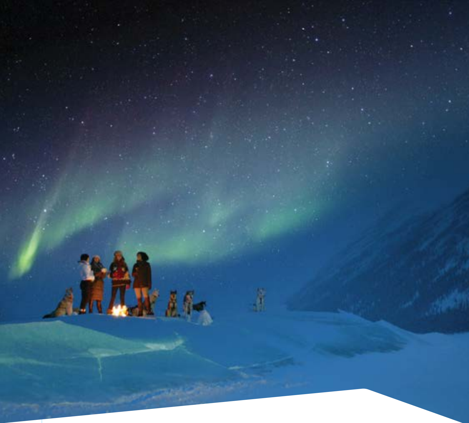
Photo: Dogsledding in Spray Valley Provincial Park with the Northern Lights above.