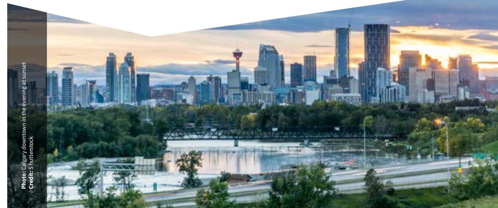
Photo: Calgary downtown in the evening at sunset

Best practices should focus on resilience, with special attention to actions that help to prepare, respond, recover and adapt to future threats/hazards.