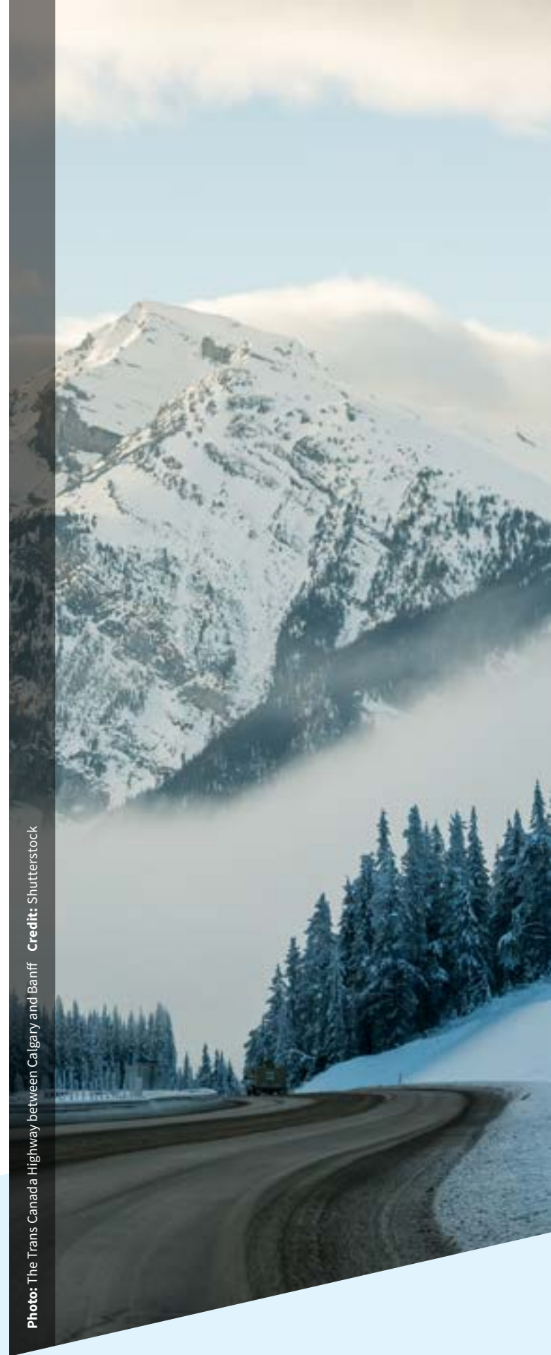
Photo: The Trans Canada Highway between Calgary and Banff Credit: Shutterstock

This topic will gather best practices and approaches of Road Asset Management measures to improve the resilience of the road infrastructure. Resilience of road network is of high importance to ensure that road user costs and socio-economic costs are reduced in case of hazards. This topic will also address the general principles of a security-minded approach as well as the technical and operational practices to protect against a range of physical and cyber threats.