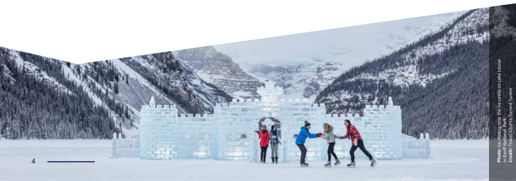
Photo: Ice skating near the ice castle on Lake Louise in Banff National Park.