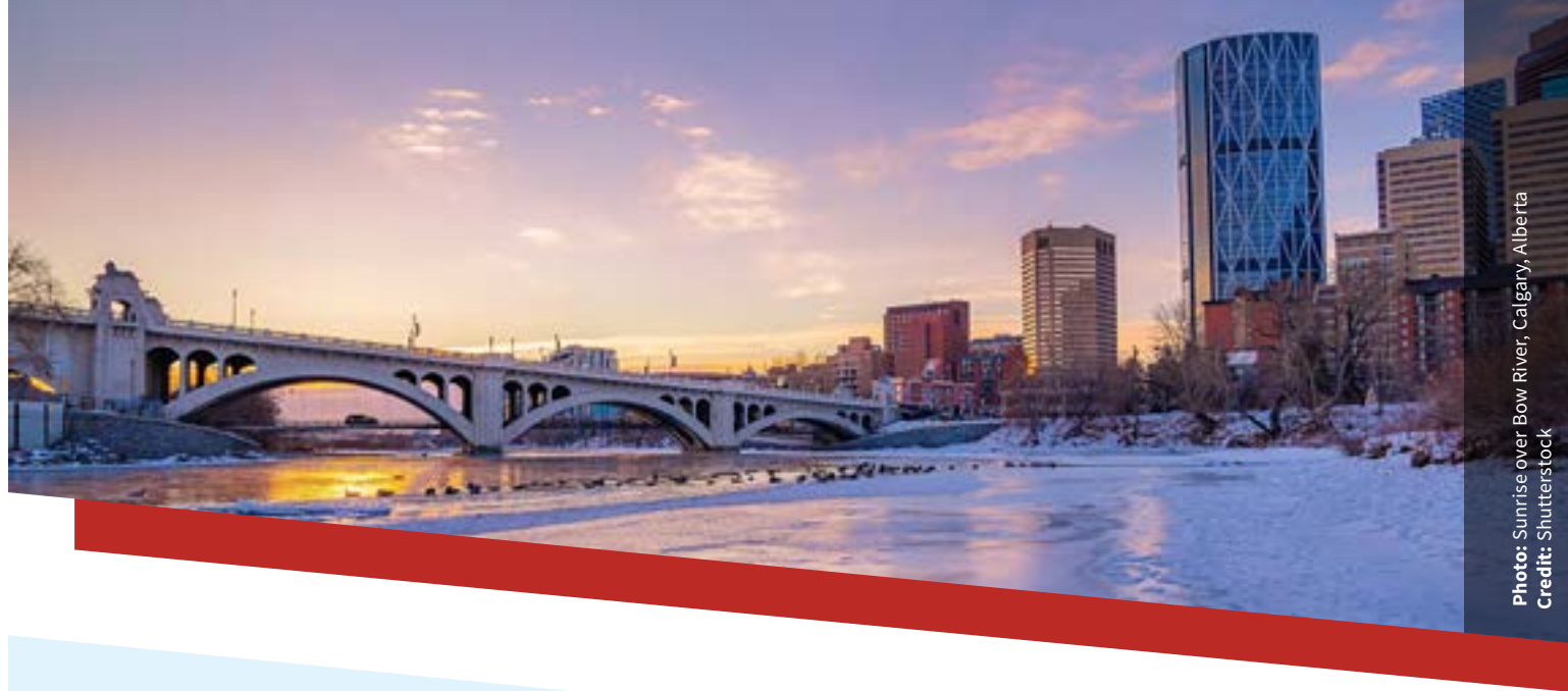
Photo: Sunrise over Bow River, Calgary, Alberta

Walk through the Calgary Traffic Management Centre and learn how we incorporate many innovative technologies and hear how our new Traffic Tuesday program aims to make motorists smile through humorous traffic safety messages. Explore our multi-layered approach to communicating with motorists in real-time about traffic conditions, congestion, lane closures, and construction delays to keep traffic moving and ensure everyone's safety.