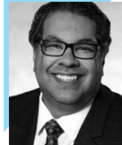
MAYOR OF CALGARY Naheed K. Nenshi

PIARC has made the wise decision to host the XVI World Winter Service and Road Resilience Congress through a virtual digital platform in 2022 to ensure everyone can participate safely in this event. While I'm disappointed that we won't be able to host in person, Calgary remains proud to be the host city for 2022. We've learned over the past year how to be creative and make meaningful connections virtually, and we'll take those learnings to ensure you feel the Calgary spirit, no matter how many miles away you may be. We look forward to discussing and sharing the latest knowledge on winter service, resiliency, and transportation with experts from around the globe.