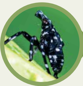
EARLY STAGE NYMPH MAY-JUL