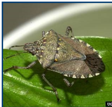
Brown marmorated stink bug