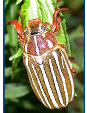
10-lined June beetle