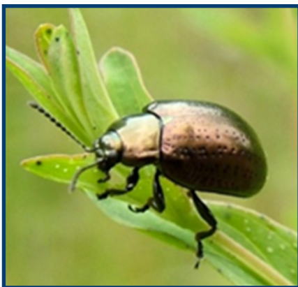
St. John's wort beetle