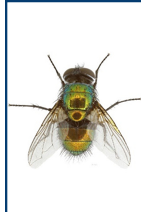
Green bottle fly