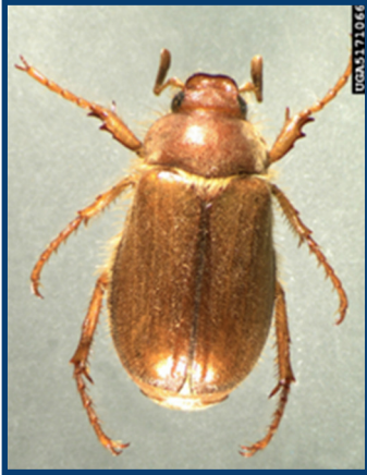
European chafer beetle