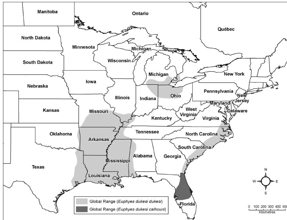
Figure 4. Estimated global range of Dukes' Skipper ( Euphyes dukesi ) based on Calhoun 1995, Lotts and Naberhaus 2017. Only Euphyes dukesi dukesi ranges in Canada. Map by G. Schaus.

In Canada, Dukes' Skipper is found in extreme southwestern Ontario in Essex, Lambton, and Chatham-Kent counties (Figure 5). There are 28 documented subpopulations 3 in Canada; 12 are extant 4 (1, 2, 14, 16, 19, 20, 21, 23, 24, 26, 27 and 28) and 16 historical 5 (3, 4, 5, 6, 7, 8, 9, 10, 11, 12, 13, 15, 17, 18, 22 and 25) (Table 1). Only one subpopulation has multiple sites 6 (#1a and 1b).