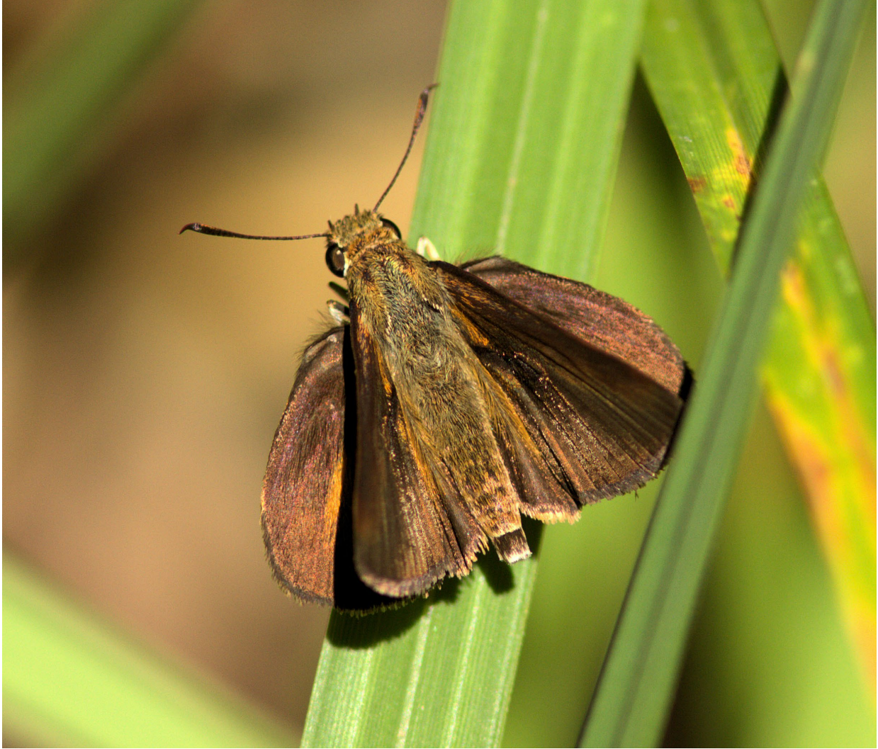
Figure 1. Dukes' Skipper ( Euphyes dukesi ) adult male. Observed, July 20, 2020, Reid Conservation Area (#27), Wallaceburg, Lambton County, Ontario. Specimen not collected.