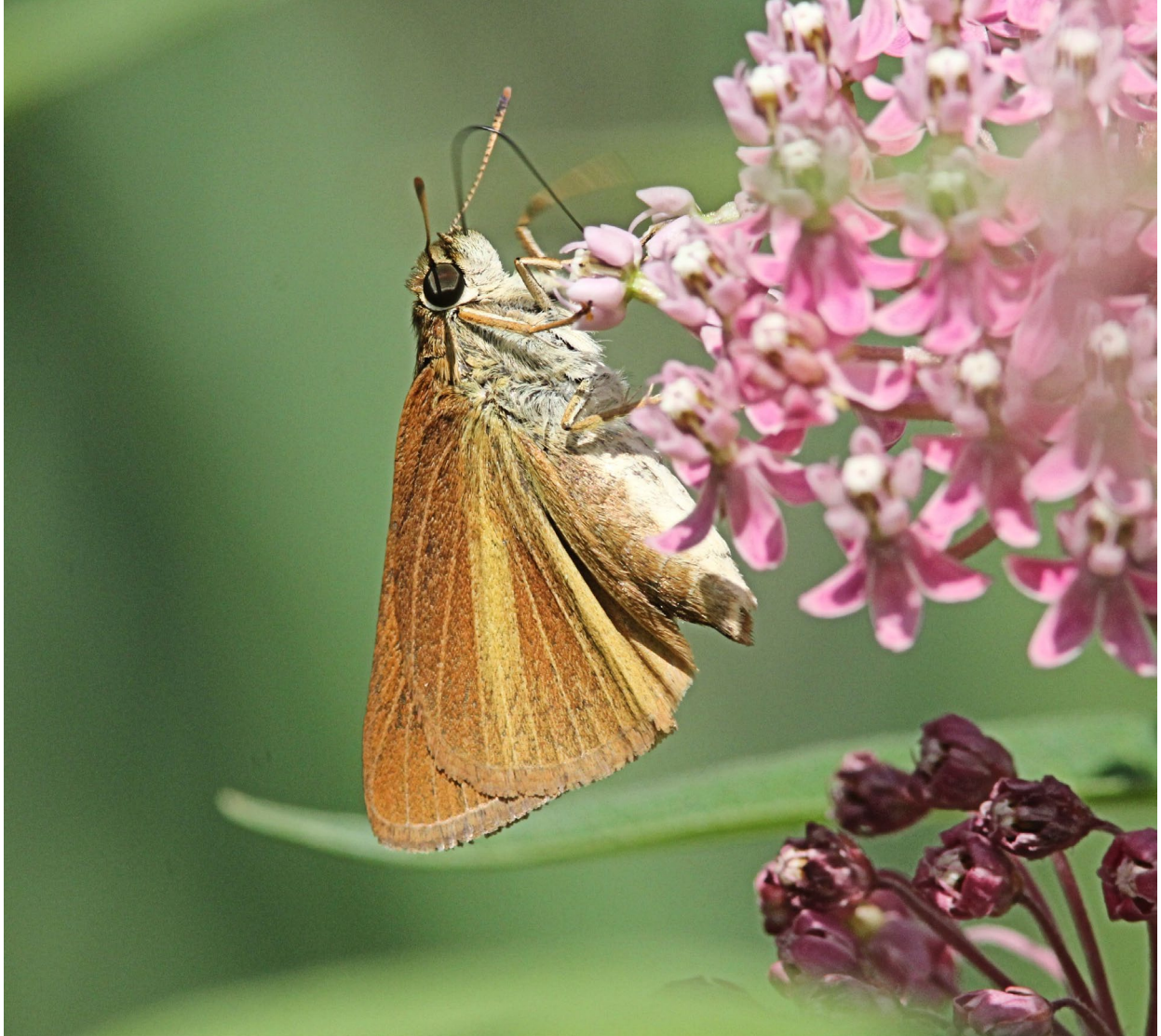
Figure 3. Dukes' Skipper ( Euphyes dukesi ) adult, underside, demonstrating one of the distinguishing ways the species is differentiated from other species, by the orange-brown overall appearance with a pale orange-yellowish streak running horizontally through the centre of the hindwing. Observed July 19, 2013, Reid Conservation Area (#27), Wallaceburg, Lambton County, Ontario. Specimen not collected.