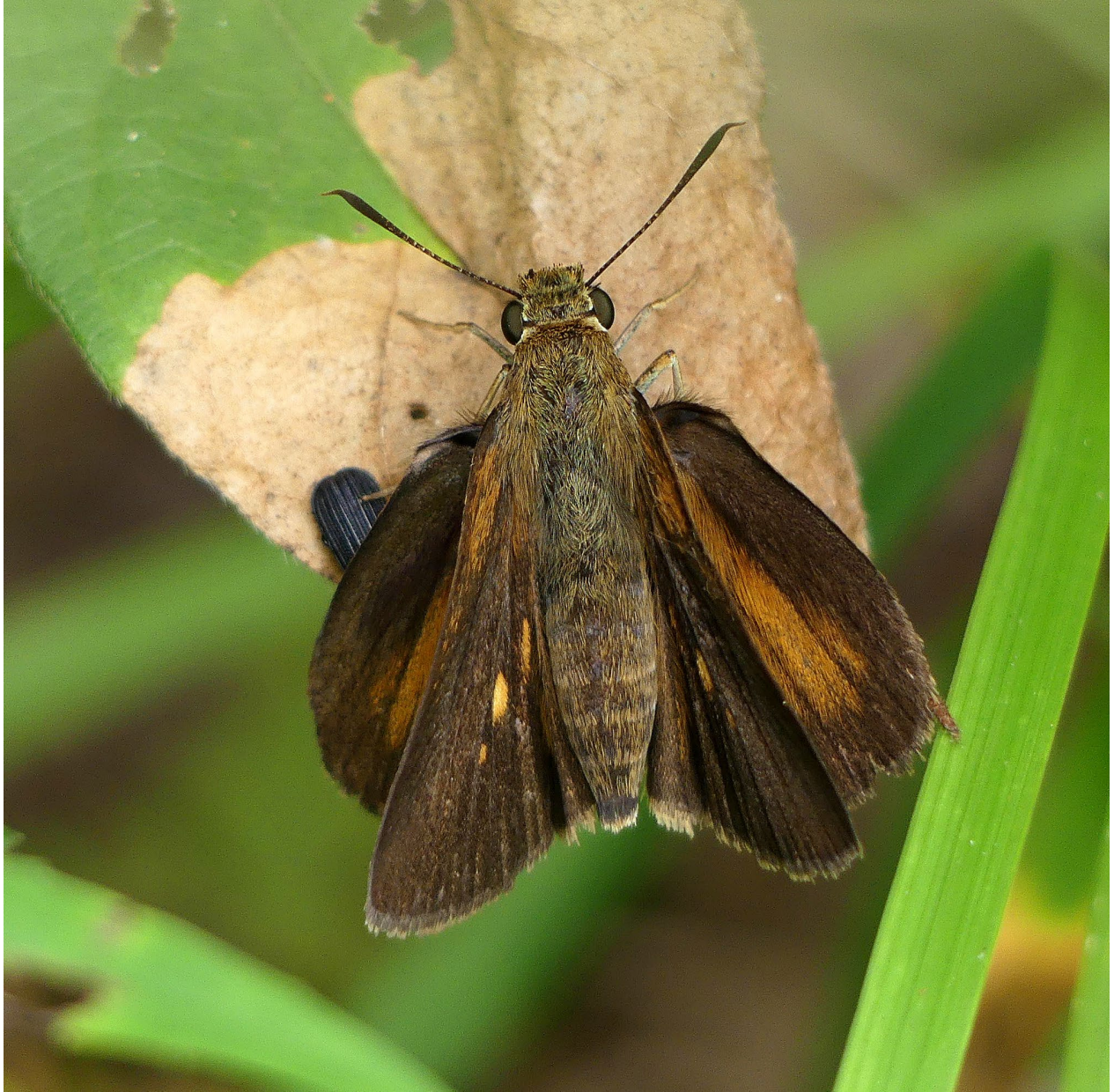
Figure 2. Dukes' Skipper ( Euphyes dukesi ) adult female. Observed July 16, 2016, Spring Garden Road Prairie, Windsor, County of Essex, Ontario. Specimen not collected.