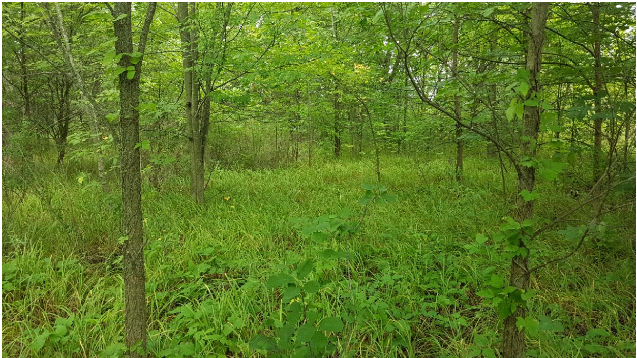
Figure 6. Dukes' Skipper ( Euphyes dukesi ) habitat within a treed sedge patch. August 30, 2020, Reid Conservation Area (#27), Wallaceburg, Lambton County, Ontario.

In Canada, Dukes' Skipper habitat includes hardwood forest swamps with natural clearings or edges containing large patches of sedges ( Carex spp.) (Hall et al. 2014) (Figure 6), floodplain forests along riverbanks, forests at the edge of marshes as well as roadside and agricultural ditches with suitable sedge patches (Michigan State University 2007; Hall et al. 2014; Macnaughton et al. 2020).